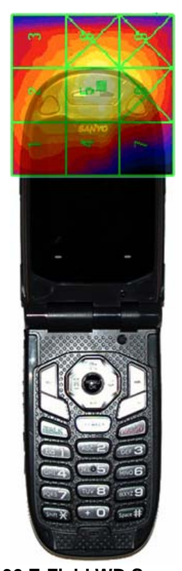
Figure 30 E-Field WD Scan overlay