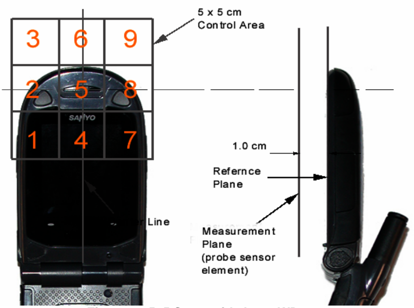
Figure 29 5x5 Scan grid above WD