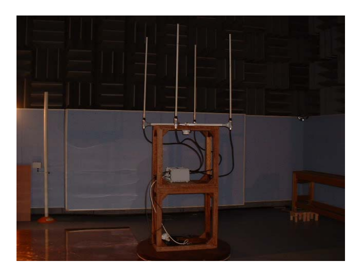
Side View(Transmitter Antenna System: ANT1-ANT4)