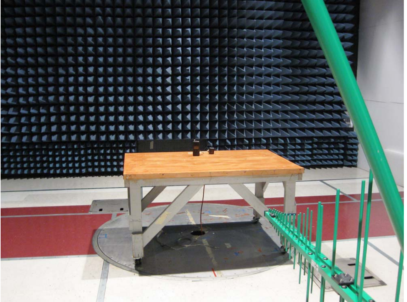
Photograph 3. Radiated Emission Limits Test Setup (30M-1GHz AC Power test setup)