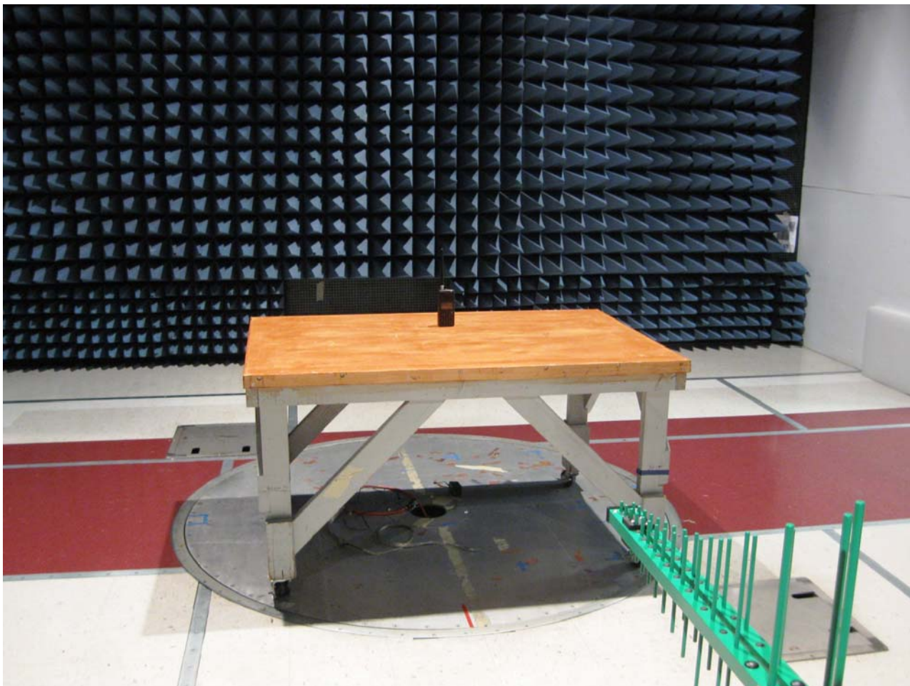
Photograph 4. Radiated Emission Limits Test Setup (30M-1GHz Battery Power test setup)