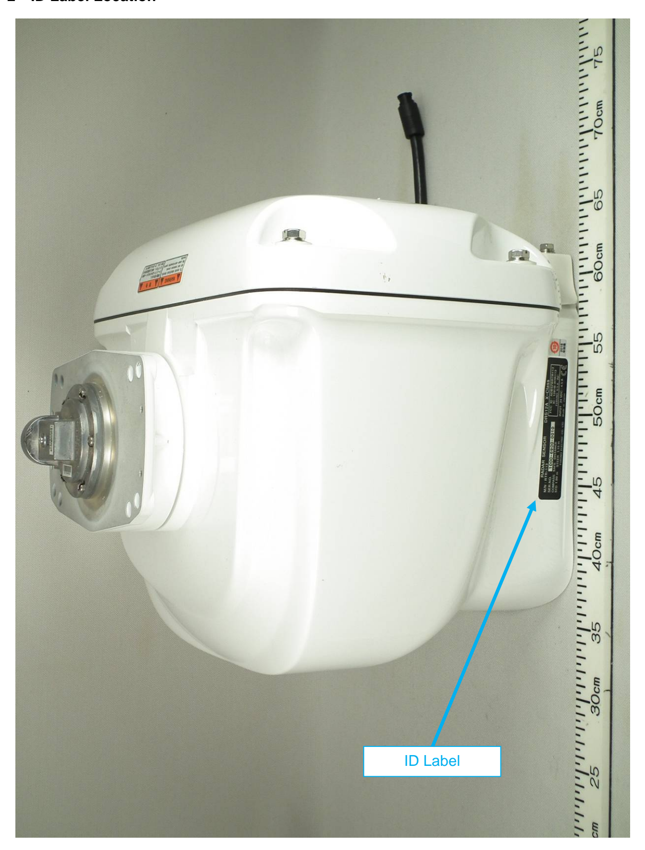
ID Label is affixed on the Scanner case.