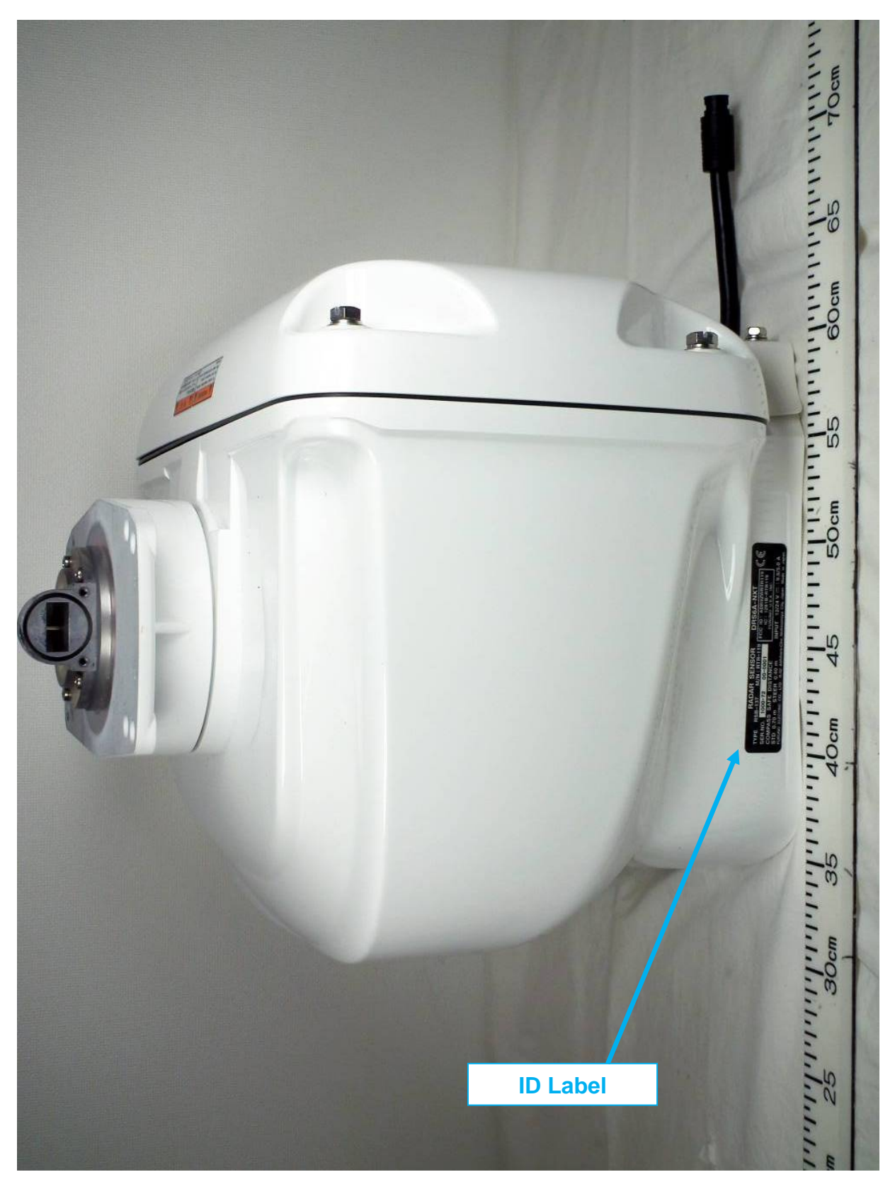
ID Label is affixed on the Scanner case.