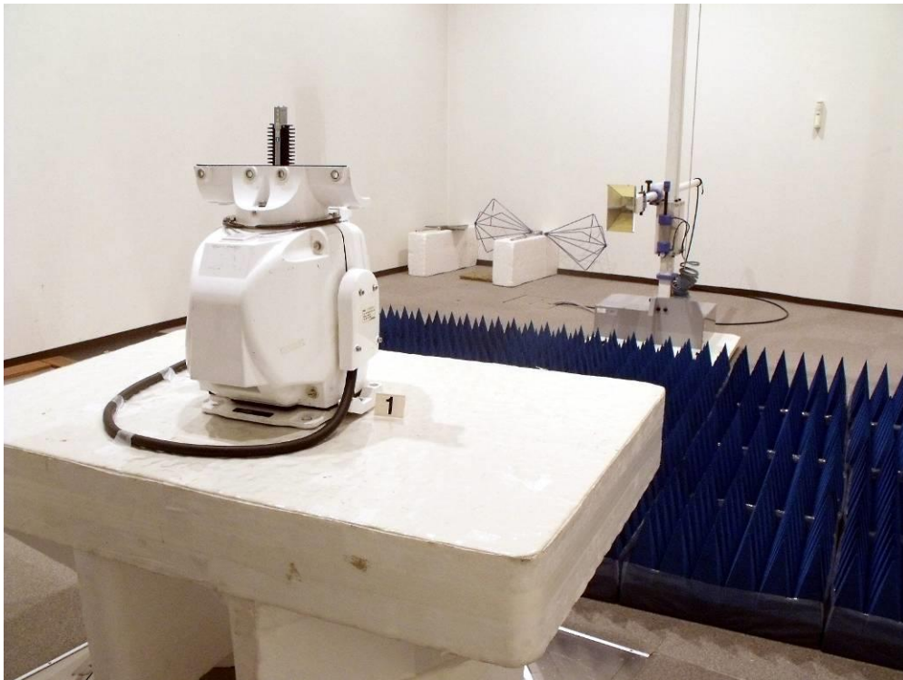
for 9 kHz to 2000 MHz