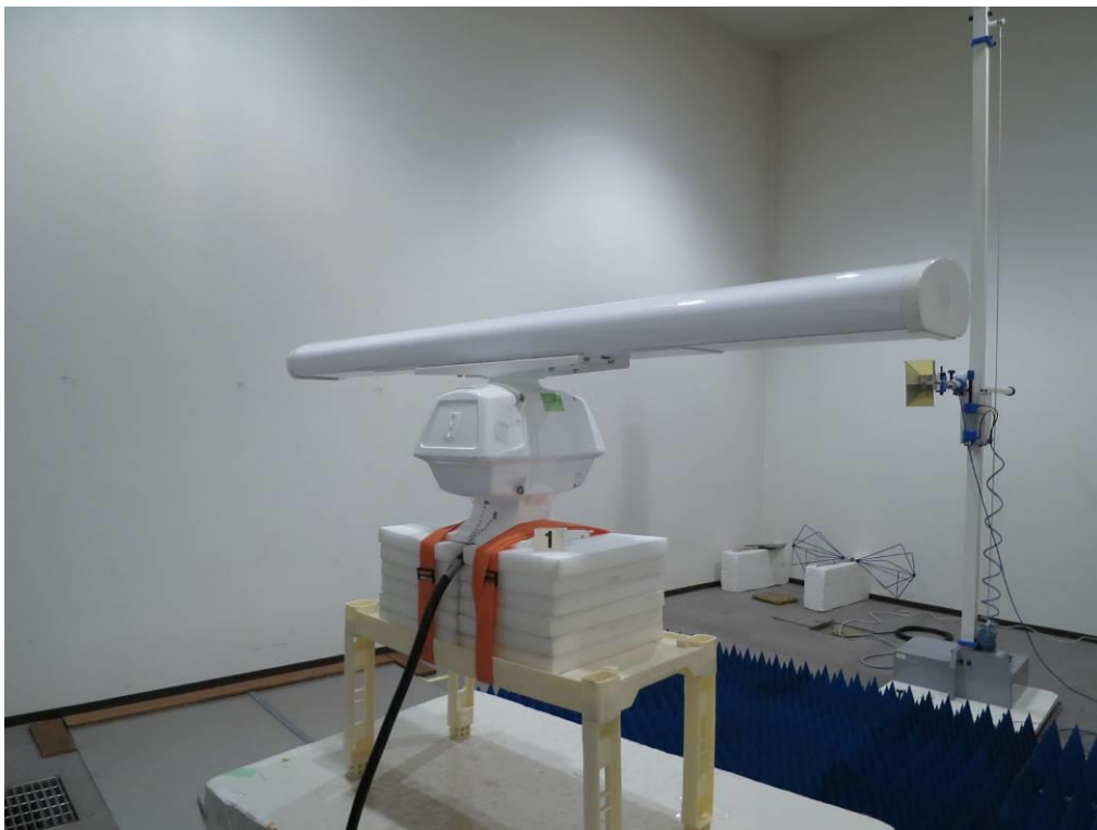
for 2 GHz to 40 GHz