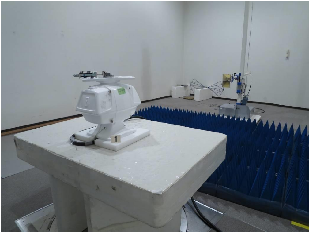
for 9 kHz to 2000 MHz

(2) For Transmitter Unwanted Emissions measurements,