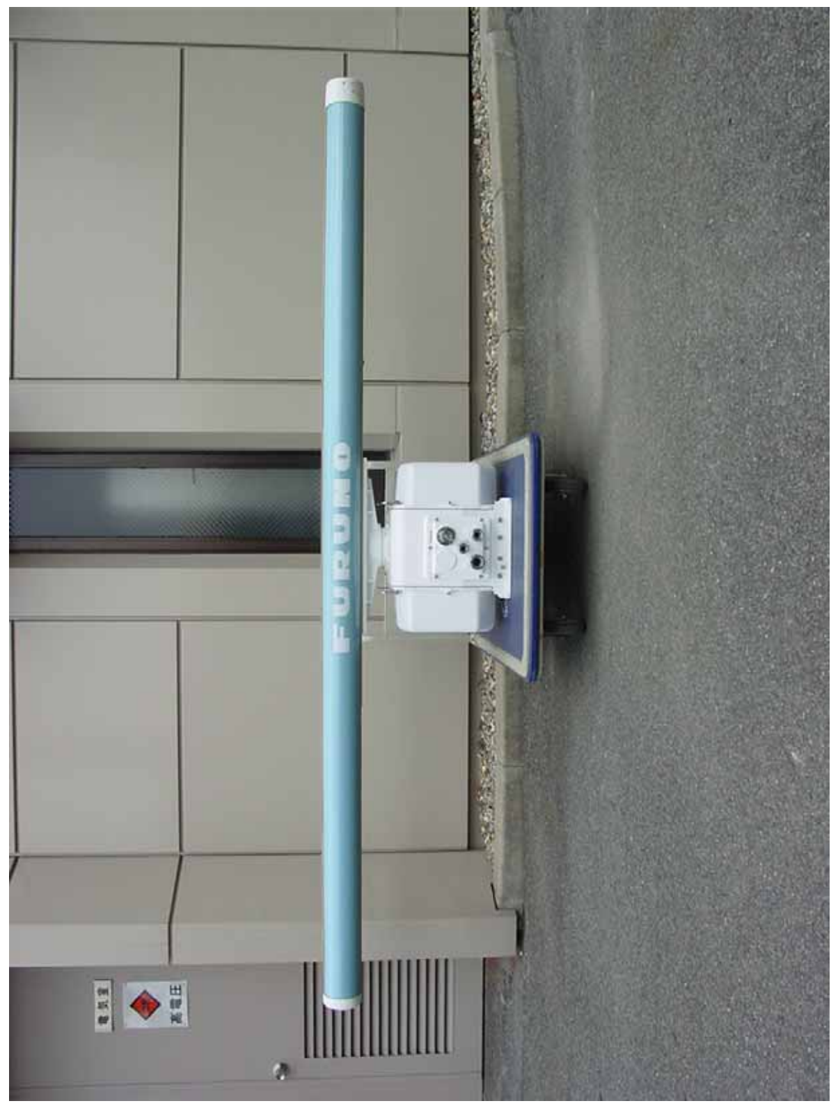
with Radiator XN-5A installed.