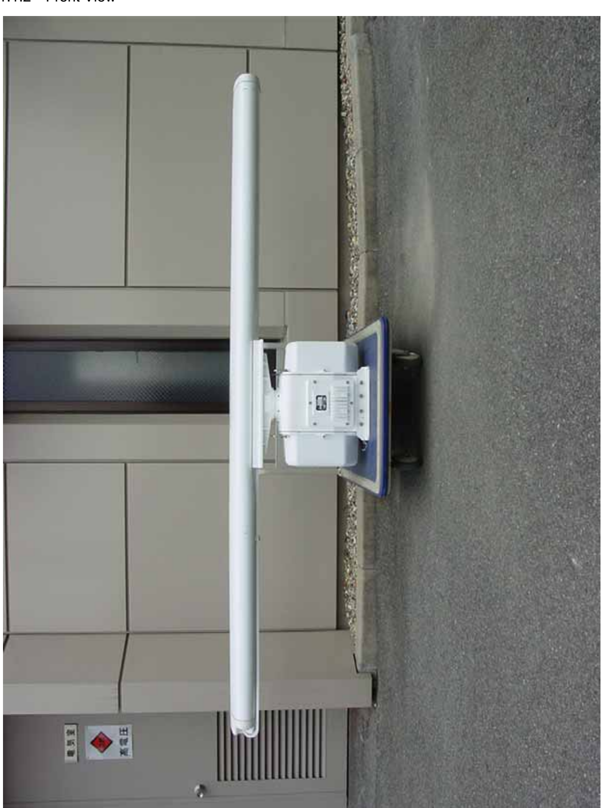
ID Label is affixed on the Scanner Case of the Antenna unit.