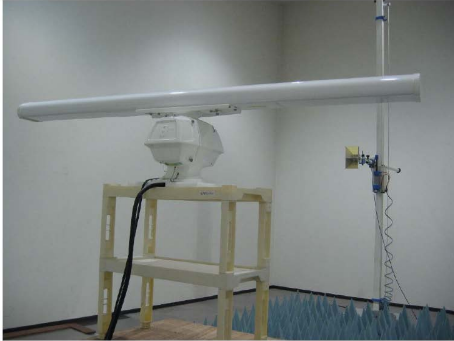
for 2 GHz to 40 GHz