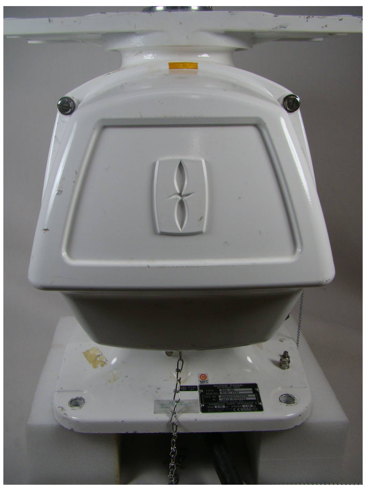
ID Label is affixed on the Scanner.