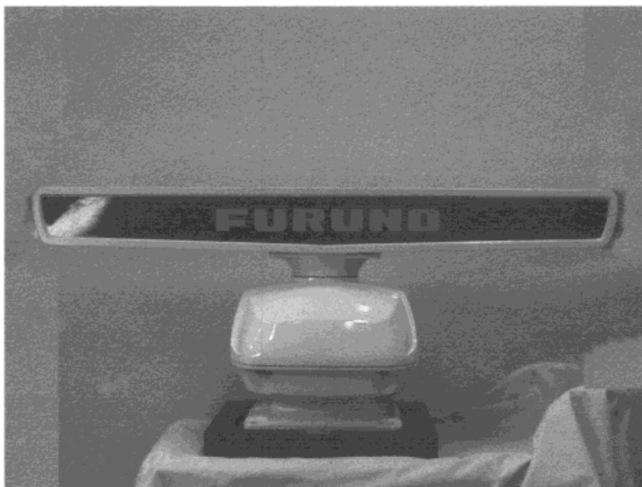
Photo 10.9 Radar Antenna Unit Front View