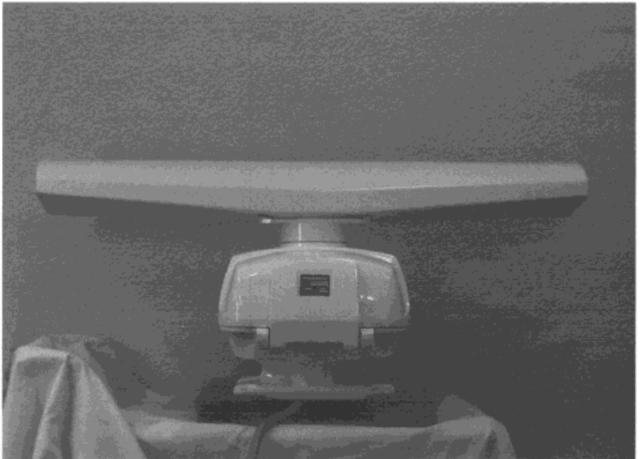
Photo 10.10 Radar Antenna Unit Rear View