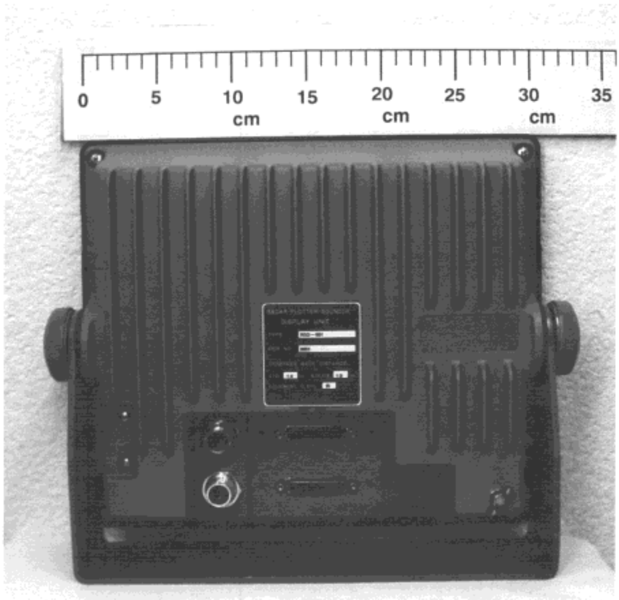
Photo 10.2 LCD Monitor Rear View