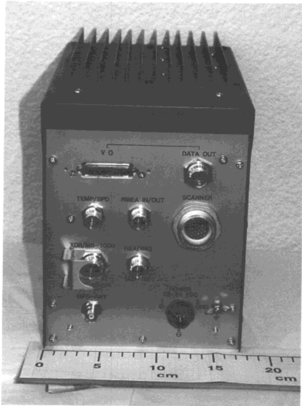
Photo 10.5 Processor Unit Rear View