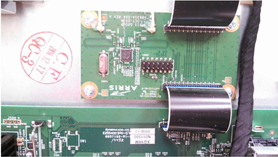
RF Board Top