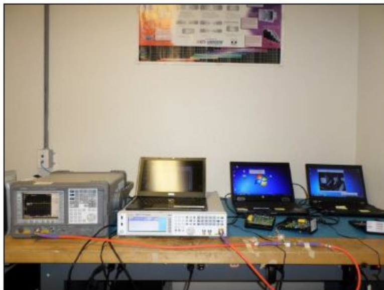
Photograph 2. DFS Test Setup