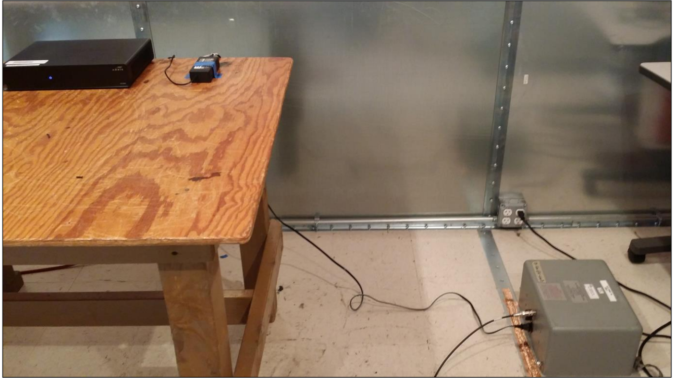
Photograph 1. Conducted Emissions, 15.207(a), Test Setup