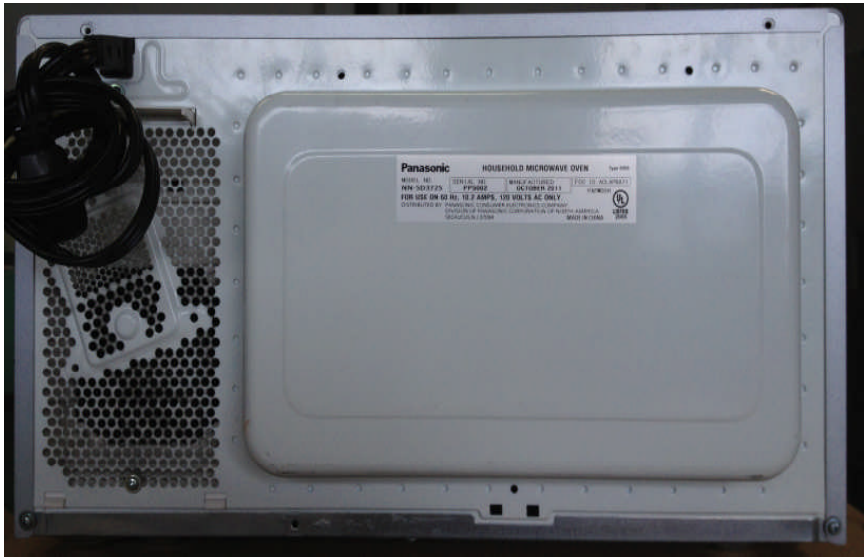
Identification Label Location (Nameplate Label) FCC ID. ACLAPBA71