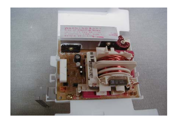
Exhibit 2-J View of Inverter Circuitry