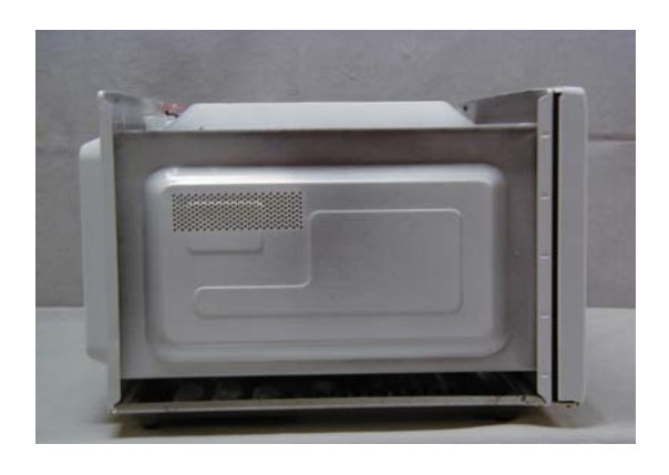
Exhibit 2-C2 Left side view, No enclosure NN-H965WF