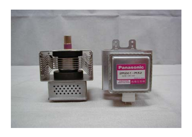
Exhibit 2-K View of Magnetron 2M261-M32