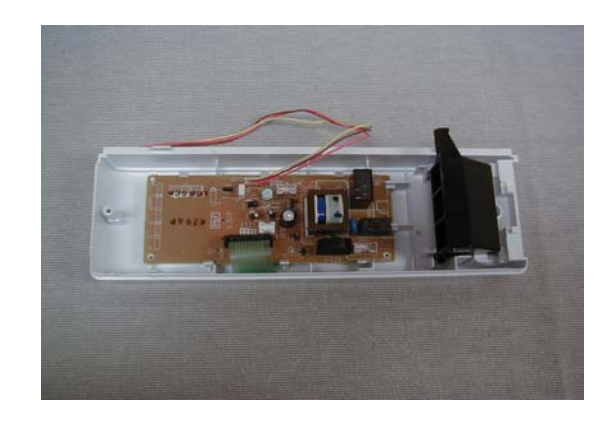
Exhibit 2-H View of Control Circuitry