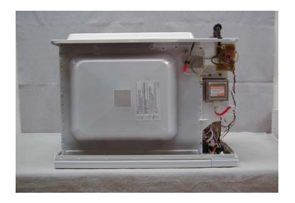
Exhibit 2-F2 Top view, No enclosure NN-H965WF