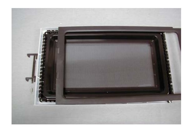
Exhibit 2-L View of Door Choke Construction