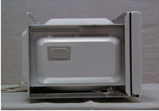
Exhibit 2-C2 Left Side View No Enclosure NN-S335WF