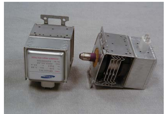
Exhibit 2-J View of Magnetro