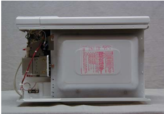
Exhibit 2-F2 Top View No Enclosure NN-S335WF