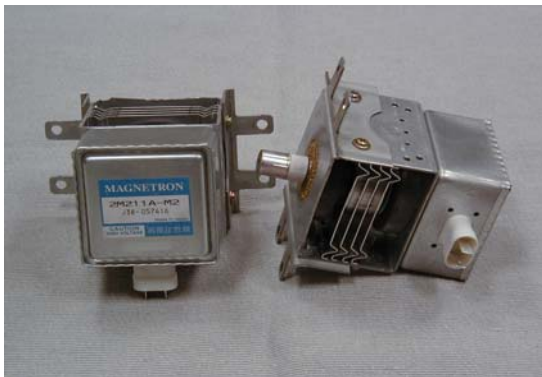
Exhibit 2-I View of Magnetron 2M211