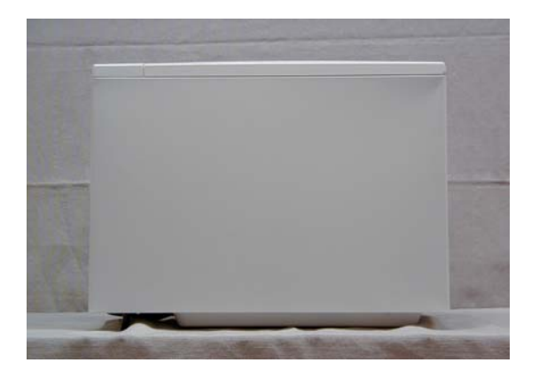
Exhibit 2-F1 Top view NN-S963WF