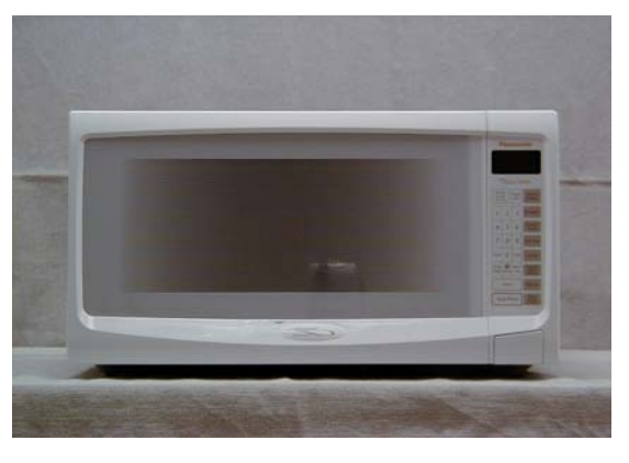
Exhibit 2-A Front view NN-S963WF