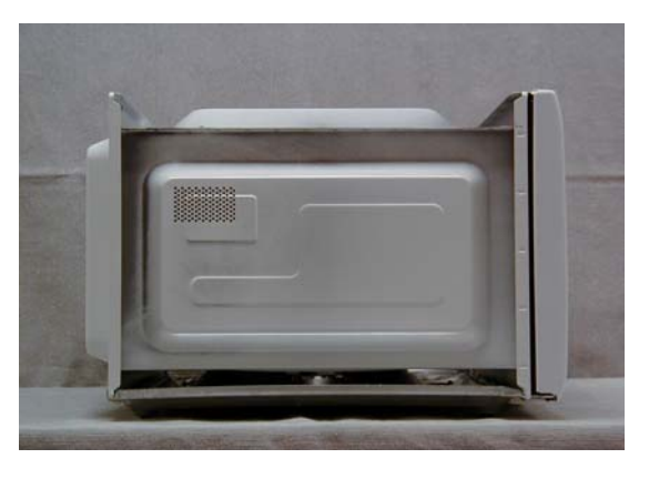
Exhibit 2-C2 Left side view, No enclosure NN-S963WF