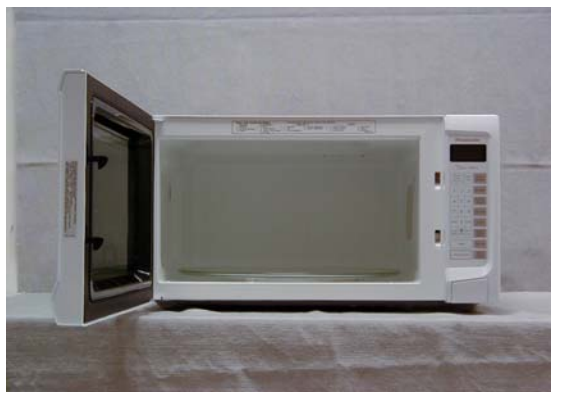
Exhibit 2-B Front view, Door open NN-S963WF