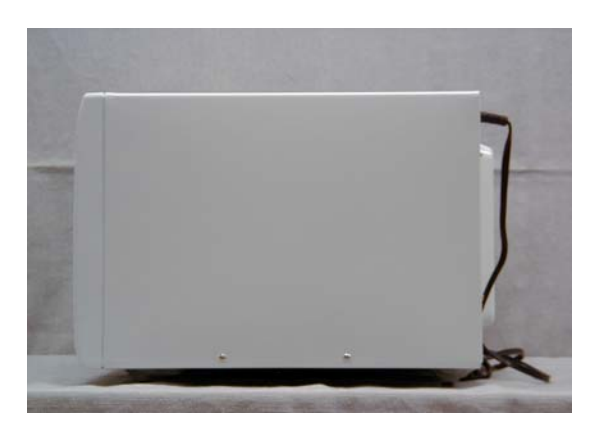
Exhibit 2-D1 Right Side view NN-S963WF