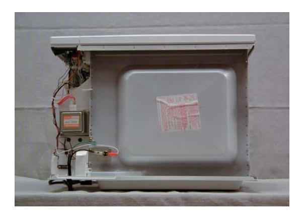
Exhibit 2-F2 Top view, No enclosure NN-S963WF