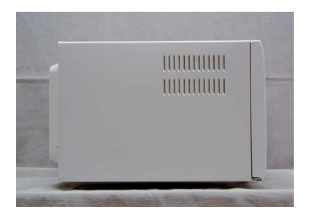
Exhibit 2-C1 Left Side view NN-S963WF