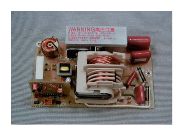
Exhibit 2-K View of Inverter Circuitry