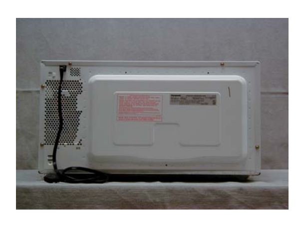
Exhibit 2-E Rear view NN-S963WF