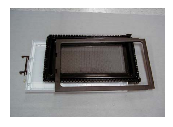
Exhibit 2-I View of Door Choke Construction