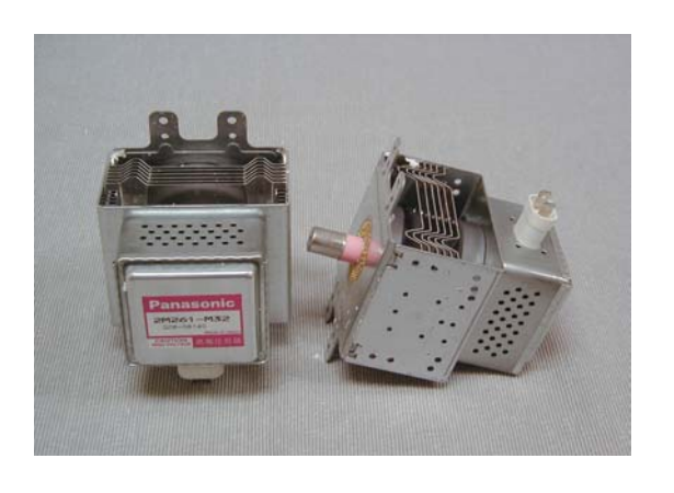
Exhibit 2-H Magnetron 2M261