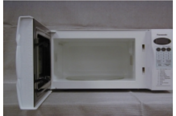
Exhibit 2-B Front view, door open NN-MX25WF