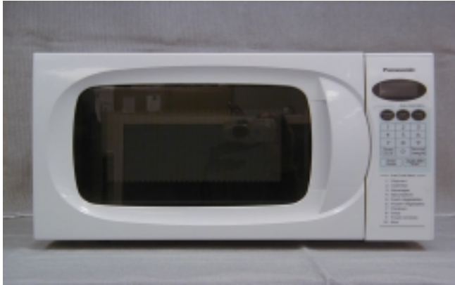
Exhibit 2-A Front view NN-MX25WF