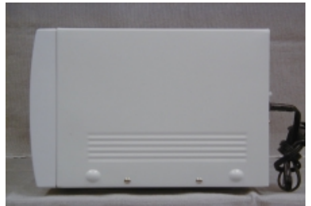
Exhibit 2-D1 Right side view NN-MX: