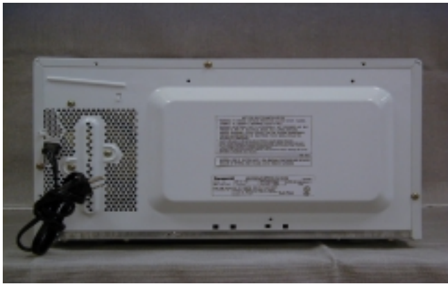
Exhibit 2-E1 Rear view NN-MX25WF