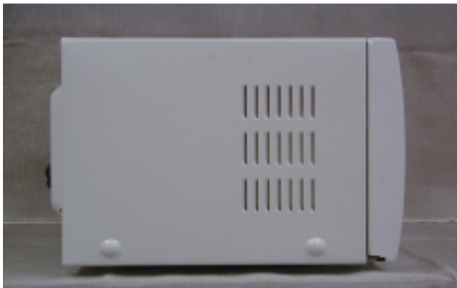
Exhibit 2-C1 Left side view NN-MX25WF