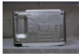
Exhibit 2-F, Bottom View Model NN-S980BA