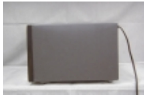
Exhibit 2-E2, Right Side View Model NN-S980BA