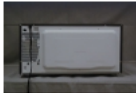
Exhibit 2-B, Rear View Model NN-S980BA