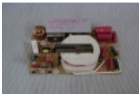
Exhibit 2-J, View of Inverter Power Supply