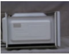
hibit 2-G1, Left Side View closure Removed del NN-S980BA