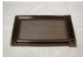
Exhibit 2-H, View of Door Construction illustrating integral choke