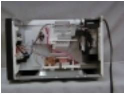
hibit 2-E1, Right Side View closure Removed del NN-S980BA