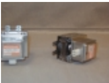
hibit 2-I , View of Magnetron I269-M32