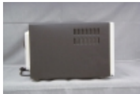
Exhibit 2-G2, Left Side View Model NN-S980BA