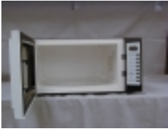
hibit 2-C, Front View- Door Open del NN-S980BA