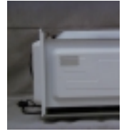
Exl En Mo