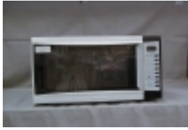
Exhibit 2-A, Front View Model NN-S980BA