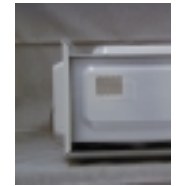
Exl Enr Mo