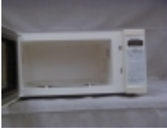
hibit 2-C, Front View- Door Open del NN-S560WF