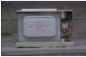
Exhibit 2-D1, Top View Enclosure Removed Model NN-S560WF