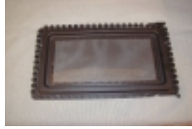
Exhibit 2-H, View of Door Construction illustrating integral choke