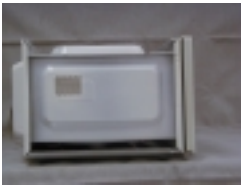
hibit 2-G1, Left Side View closure Removed del NN-S560WF