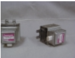
hibit 2-I , View of Magnetron I261-M32