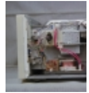
Exl Enr Mo