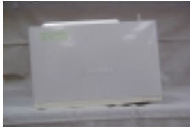
Exhibit 2-D2, Top View Model NN-S560WF