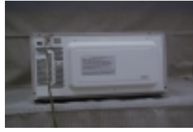
Exhibit 2-B, Rear View Model NN-S560WF