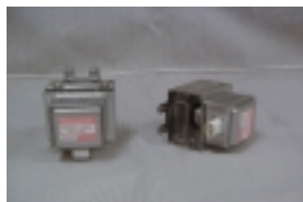
Exhibit 2-J, View of Magnetron 2M258-M32