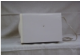
Exhibit 2-E2, Right Side View Model NN-S560WF