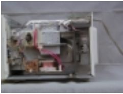
hibit 2-E1, Right Side View closure Removed del NN-S560WF