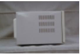
Exhibit 2-G2, Left Side View Model NN-S560WF