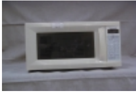
Exhibit 2-A, Front View Model NN-S560WF