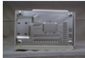
Exhibit 2-F, Bottom View Model NN-S560WF