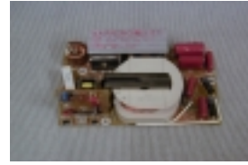
Exhibit 2-K, View of Inverter Power Supply