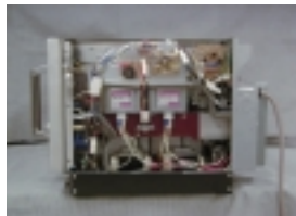
Exhibit 2-D2 Right Side view, no enclosure NE-C1153