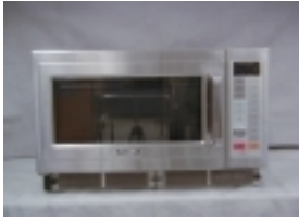
Exhibit 2-A Front view NE-C1153