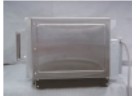
Exhibit 2-D1 Right Side view NE-C1153