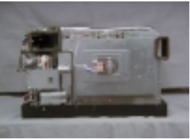
Exhibit 2E-2 Rear view, no enclosure NE-C1153