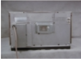
Exhibit 2-E1 Rear view NE-C1153