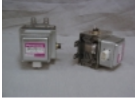
Exhibit 2-H Magnetron 2M-167-M1