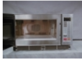
Exhibit 2-B Front view, door open NE-C1153