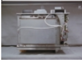
Exhibit 2-F2 Top view, no enclosure NE-C1153