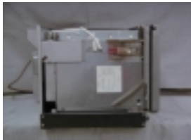
Exhibit 2-C2 Left Side view, no enclosure NE-C1153