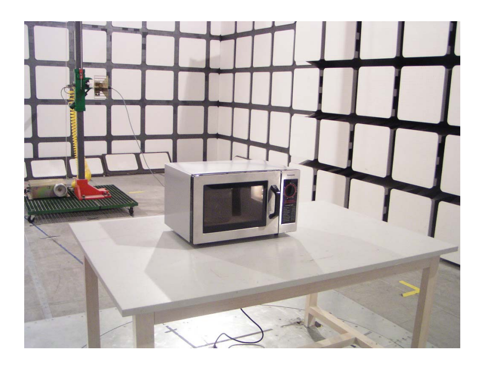
Above 1 GHz: Radiated Emission - Rear View