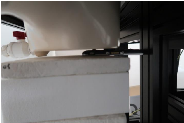
Bottom Face with Barcode L, Separation 0 mm