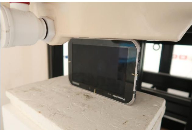
Edge 3 with Barcode L , Test Separation 0 mm