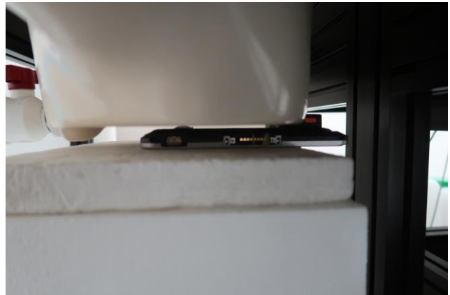
Bottom Face with Barcode P, Test Separation 0 mm