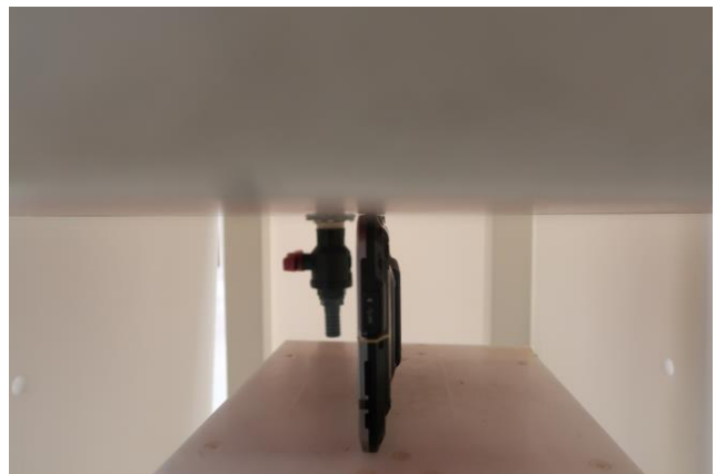
Edge 3 with Battery 2, Test Separation 0 mm