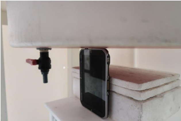
Edge 2, Test Separation 0 mm