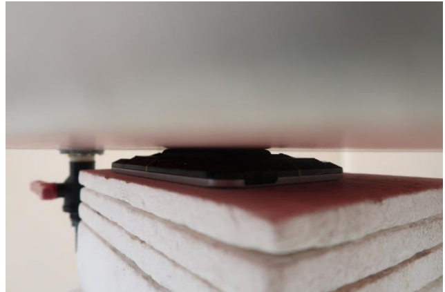
Bottom Face with Battery 2, Test Separation 0 mm