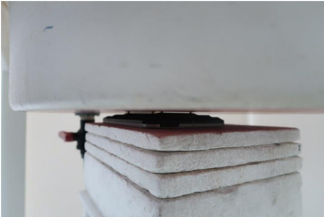
Bottom Face, Test Separation 0 mm