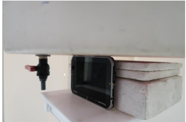
Edge 3, Test Separation 0 mm