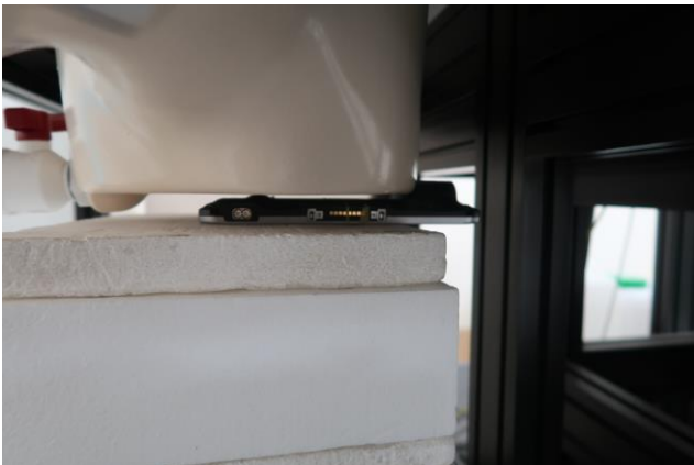
Bottom Face with USB Port, Test Separation 0 mm