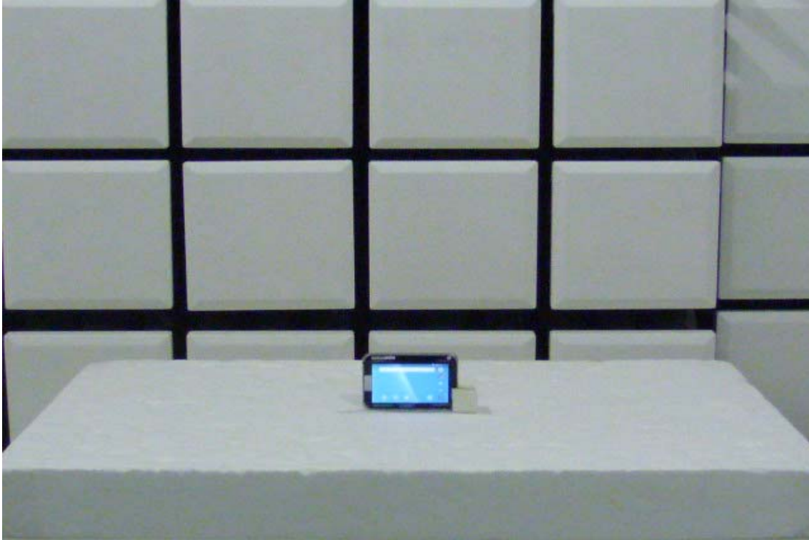
Front View of test setup

Unless otherwise stated the results shown in this test report refer only to the sample(s) tested and such sample(s) are retained for 90 days only.