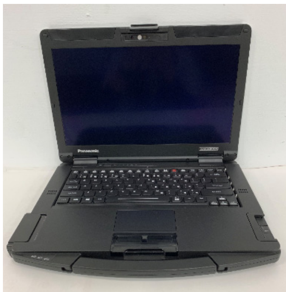
The view of Edge2