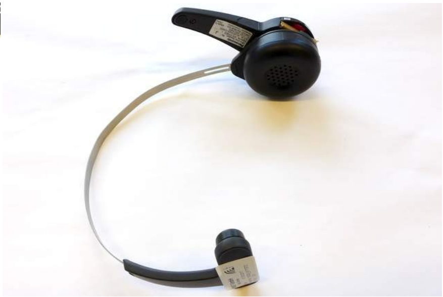
Pic. 1: Front and right side view of the device under test.