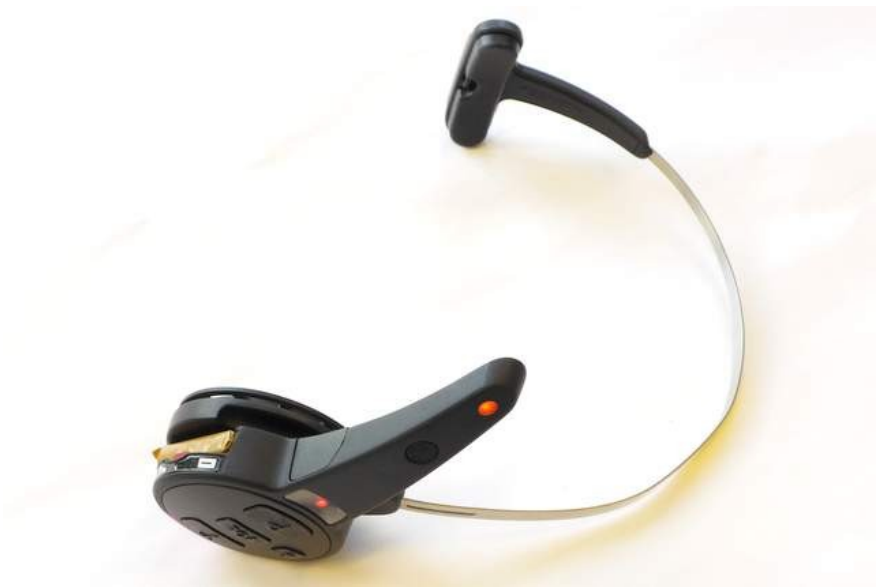
Pic. 2: Back and left side view of the device under test.