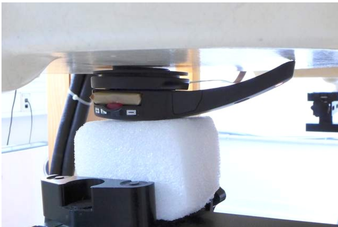
Pic. 3: Test position – inner side, 0mm distance to phantom.