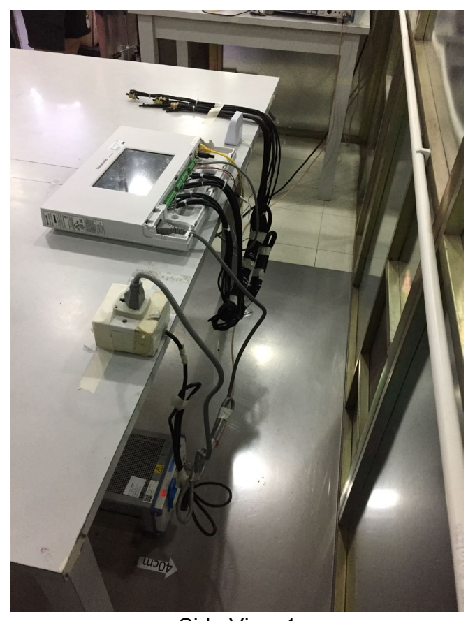
Side View 1