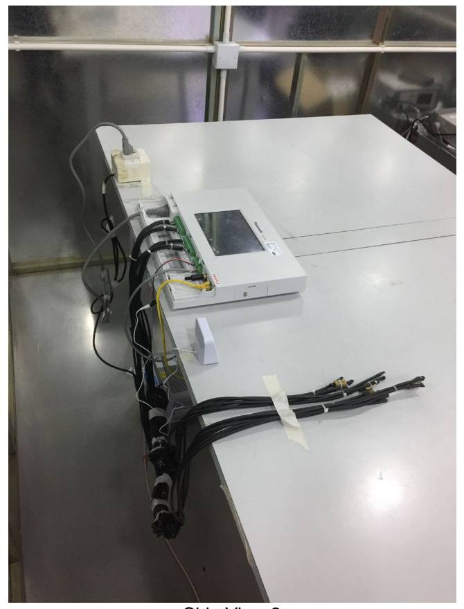
Side View 2

FCC ID: ACJ9TAWX-CC412BP IC: 216A-WXCC412BP