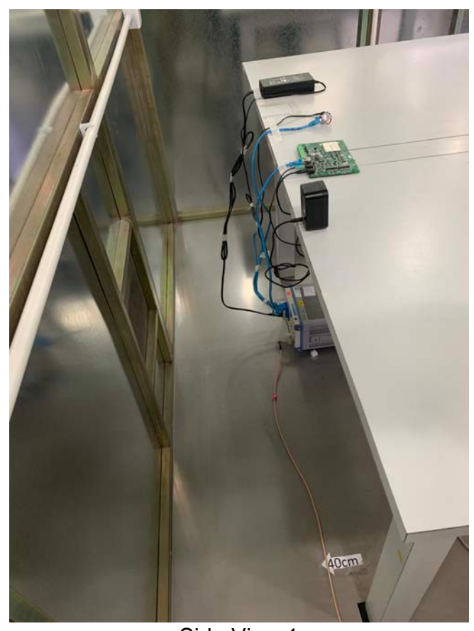
Side View 1

Test Report Number: 19100875HKG-001, 19100875HKG-002