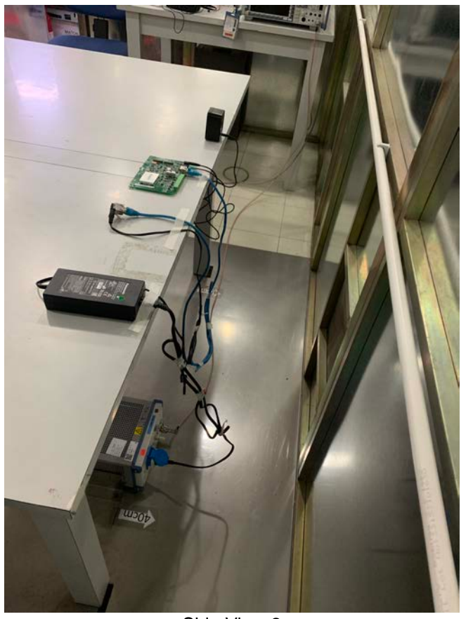
Side View 2

Test Report Number: 19100875HKG-001, 19100875HKG-002