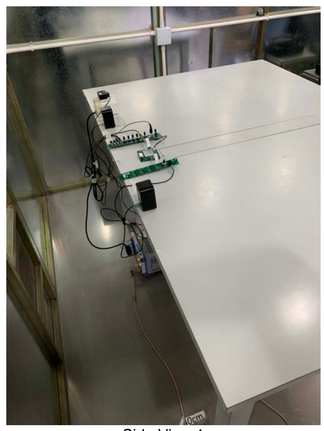
Side View 1

Test Report Number: 19090108HKG-001, 19090108HKG-002