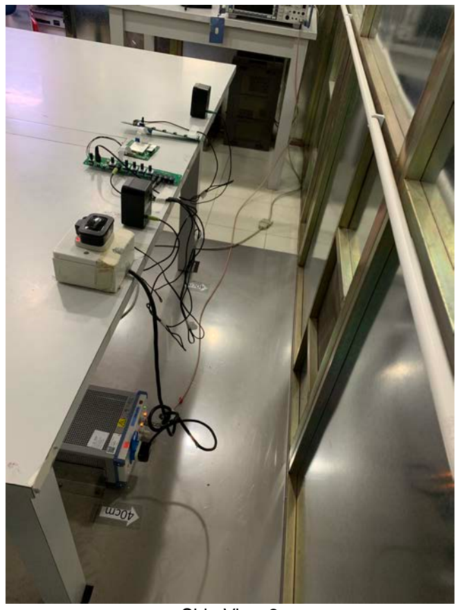
Side View 2

Test Report Number: 19090108HKG-001, 19090108HKG-002