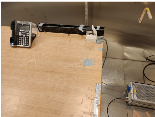
Power-Line Conducted Emissions