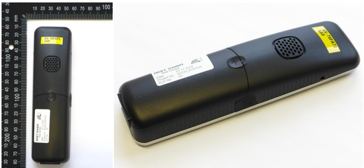
Pic. 2: Back side views of the device under test.