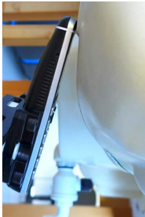
Pic. 7: Tilted position, right side.