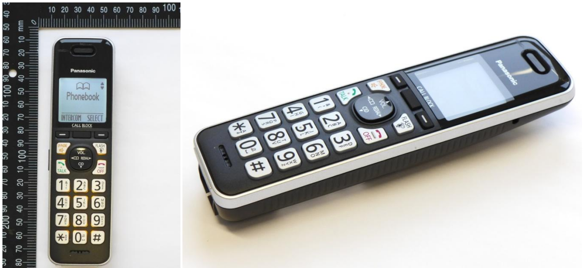
Pic. 1: Front side views of the device under test.