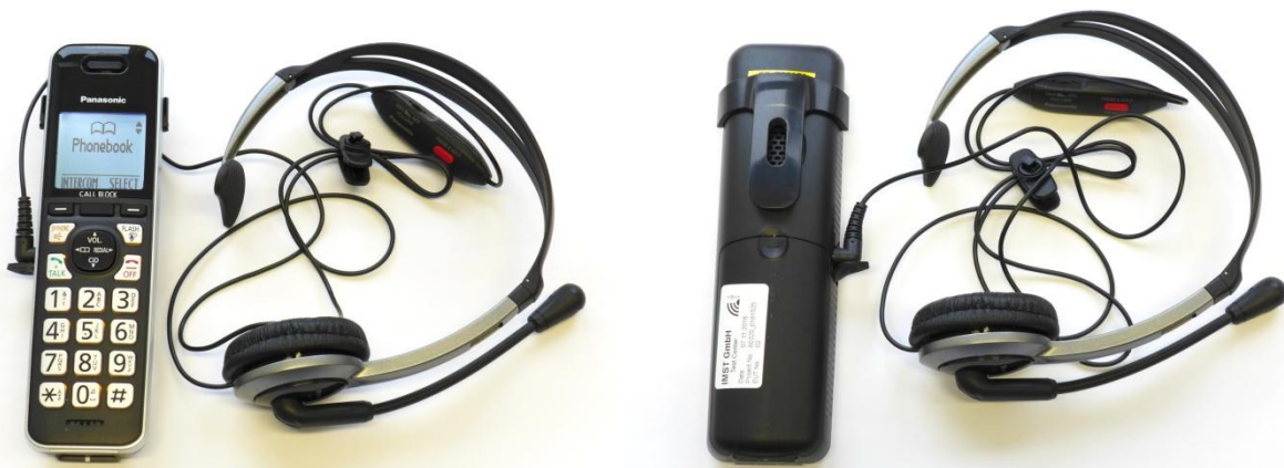
Pic. 3: Front and back sides of the device under test with attached headset and belt clip