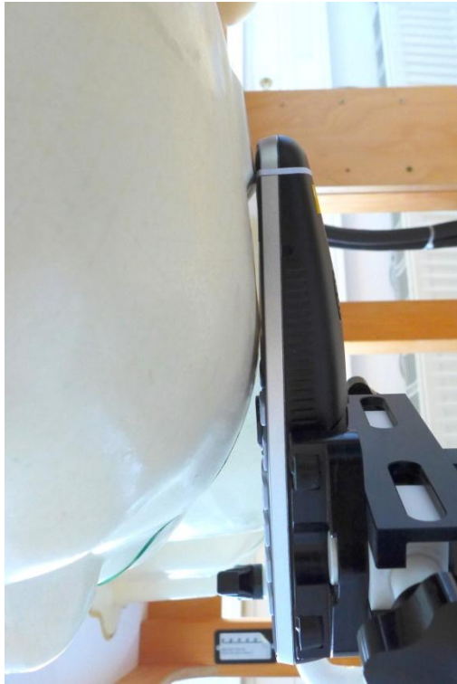
Pic. 4: Cheek position, left side.