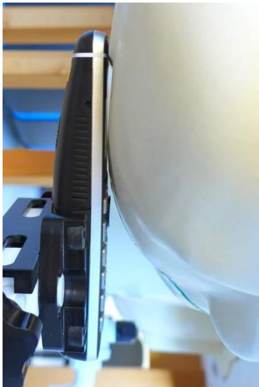
Pic. 6: Cheek position, right side.