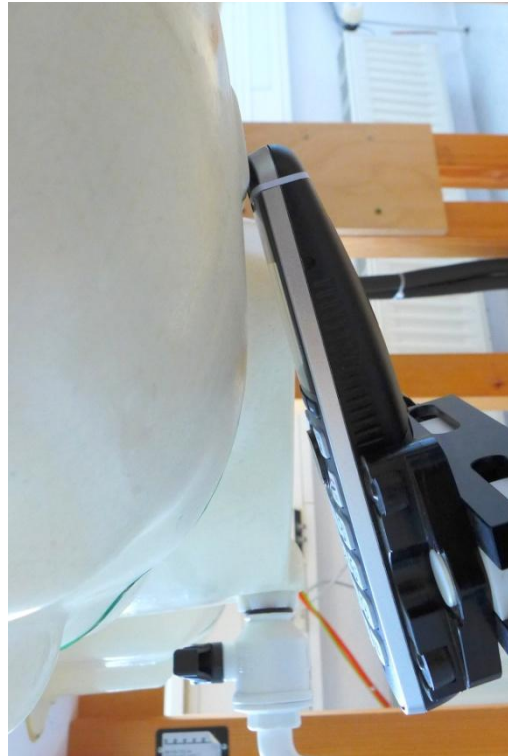
Pic. 5: Tilted position, left side.