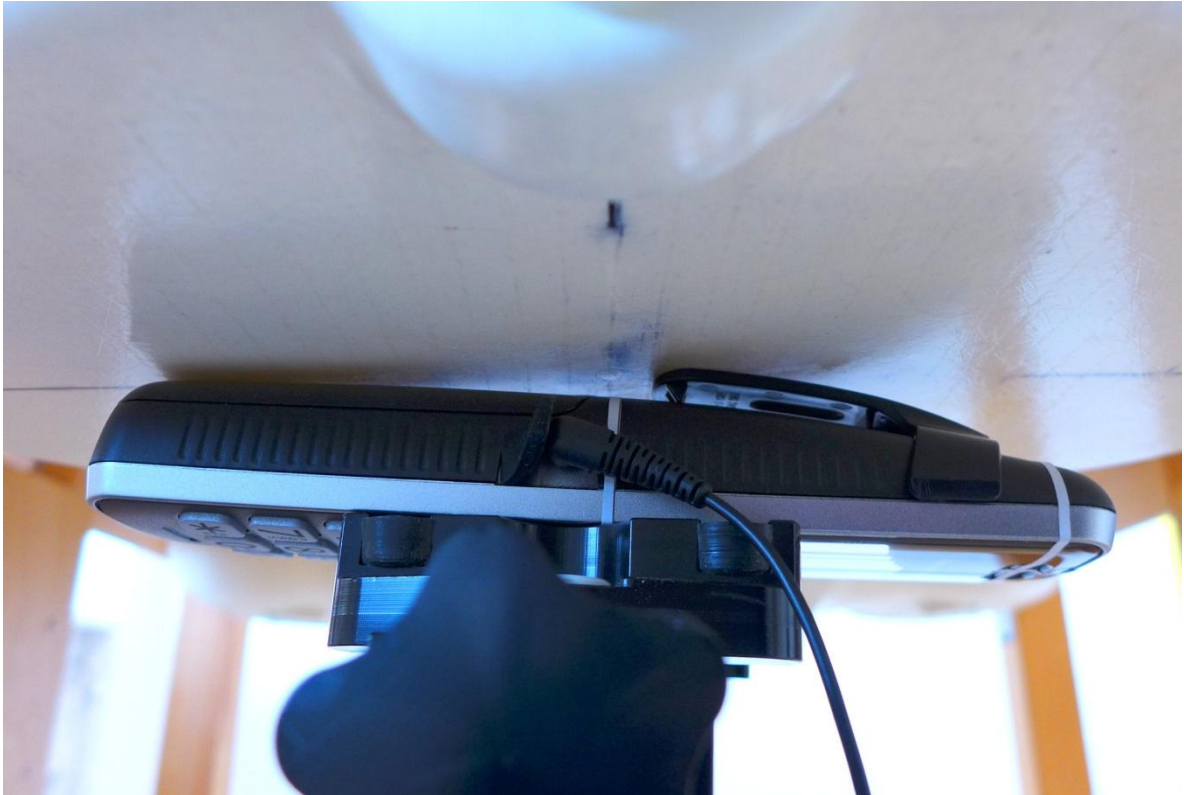
Pic. 9: Test position back side of EUT towards the phantom, 0 mm gap, belt clip and headset attached.