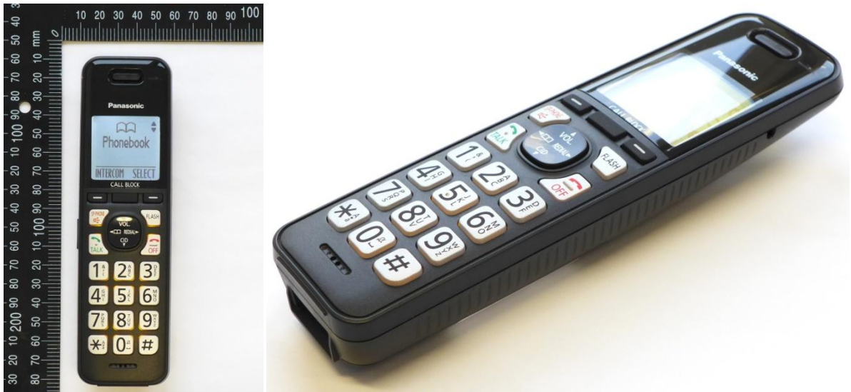
Pic. 1: Front side views of the device under test.