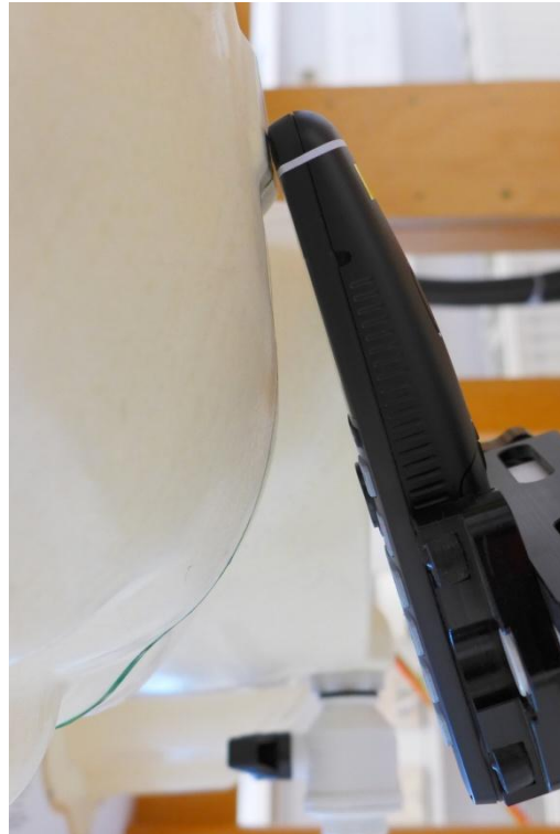
Pic. 5: Tilted position, left side.