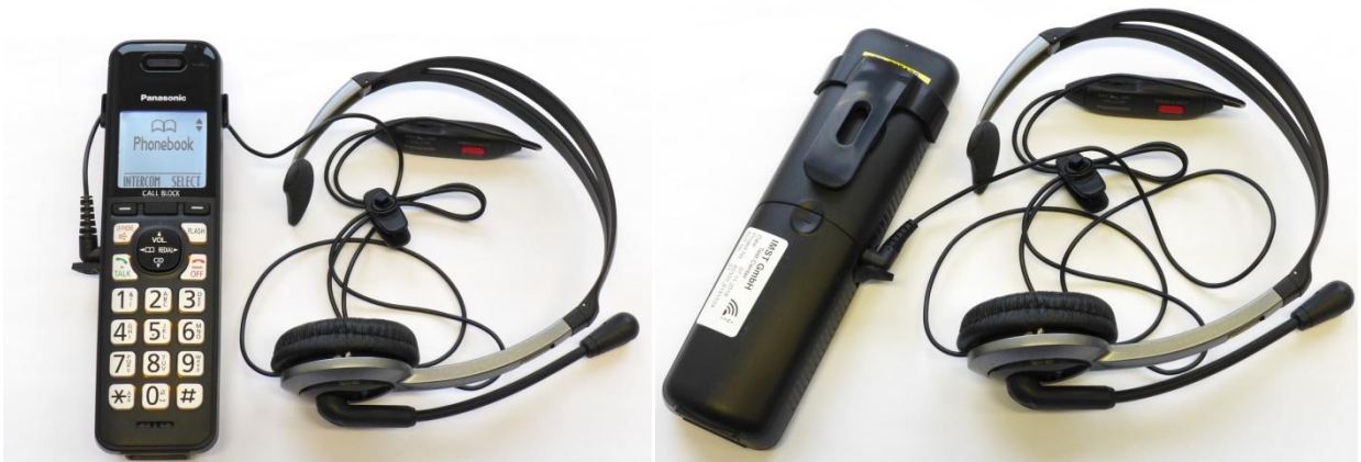
Pic. 3: Front and back sides of the device under test with attached headset and belt clip