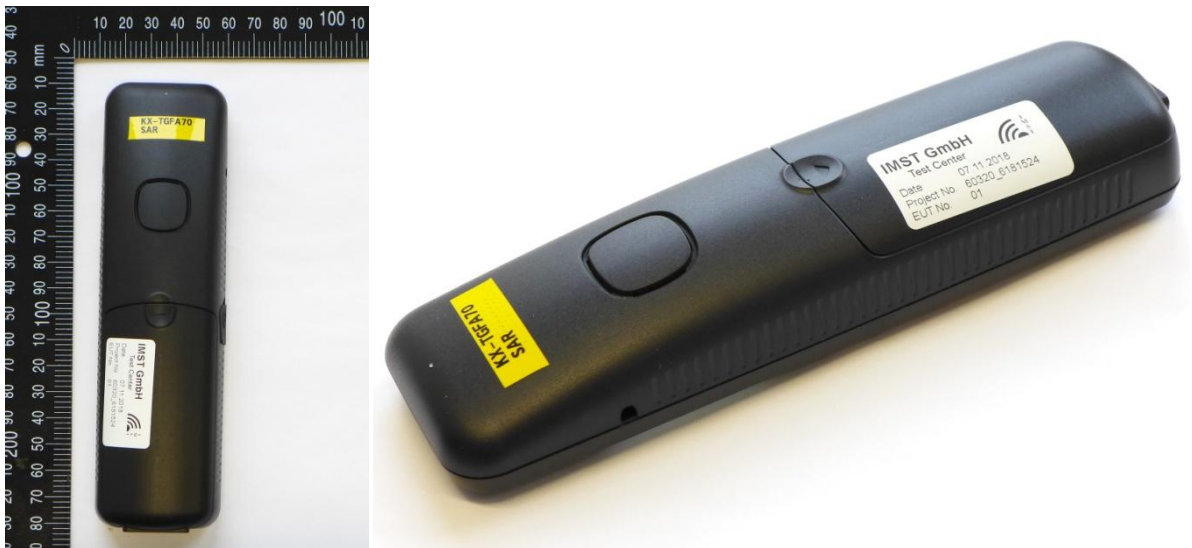
Pic. 2: Back side views of the device under test.