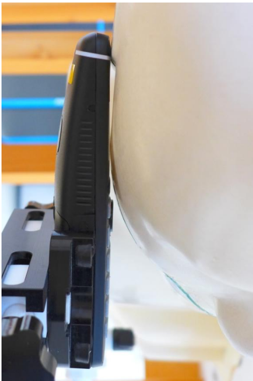
Pic. 6: Cheek position, right side.