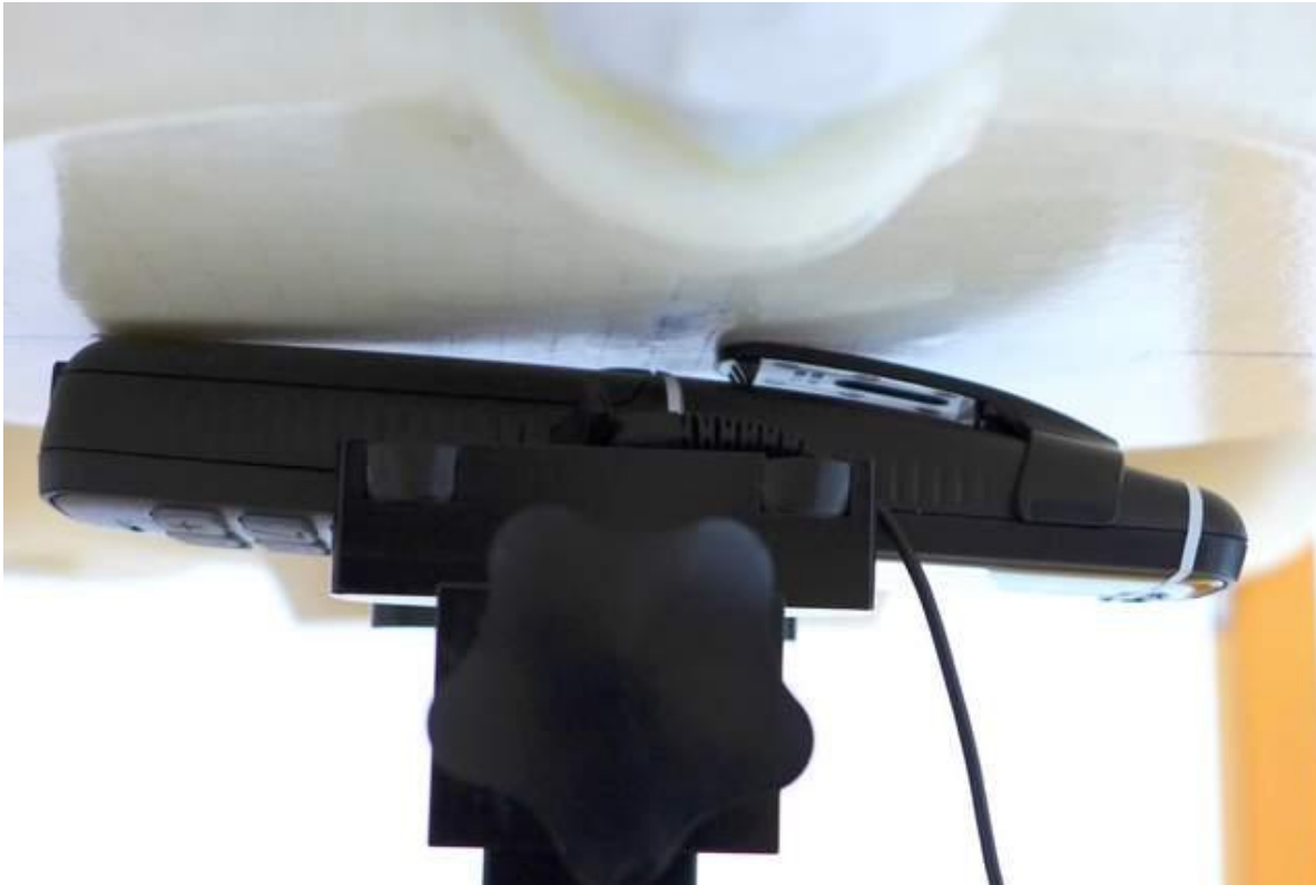
Pic. 9: Test position back side of EUT towards the phantom, 0 mm gap, belt clip and headset attached.