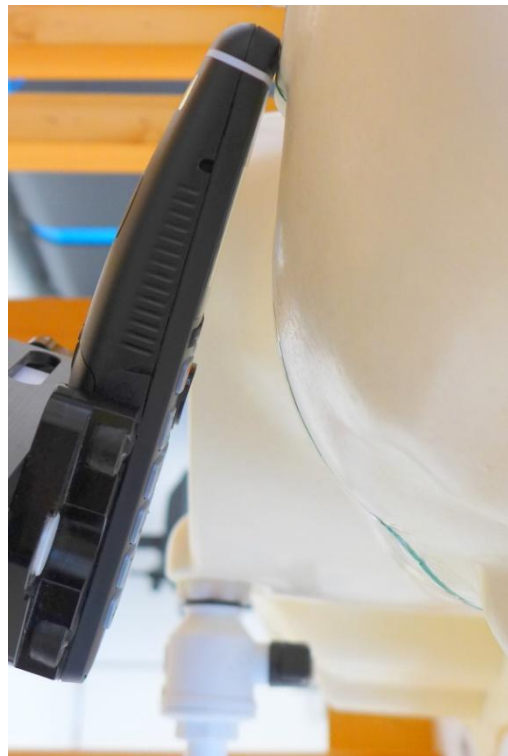
Pic. 7: Tilted position, right side.