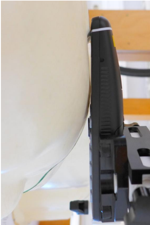
Pic. 4: Cheek position, left side.