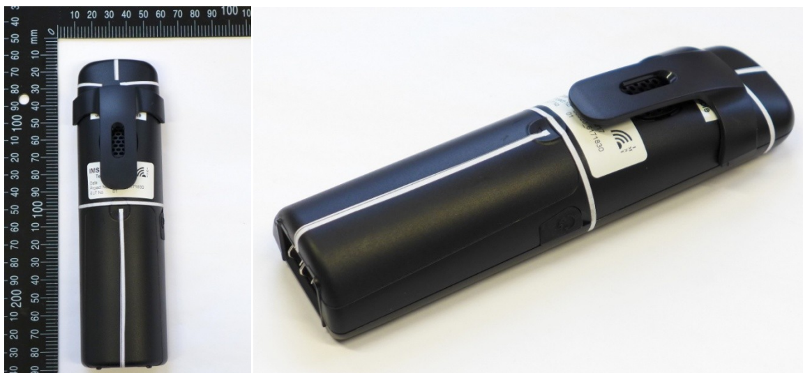
Pic. 2: Back and left side views of the device under test.