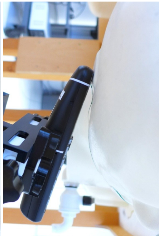
Pic. 6: Tilted position, right side.