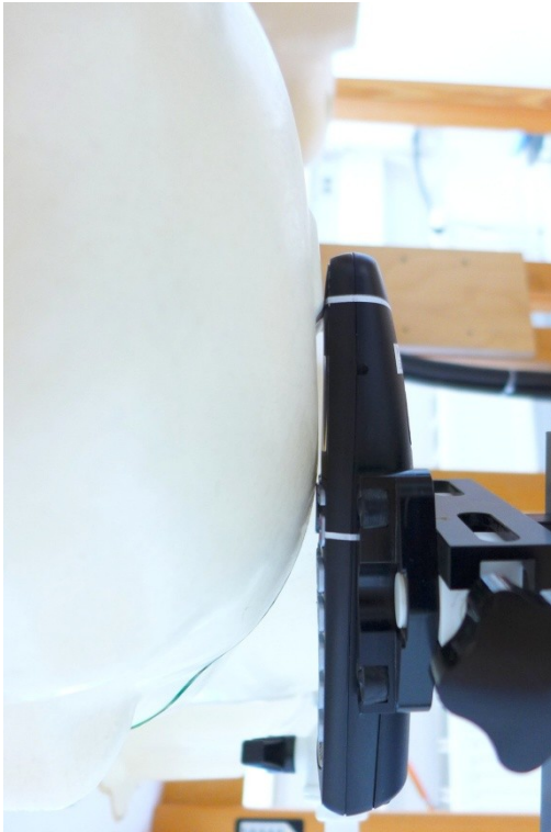
Pic. 3: Cheek position, left side.