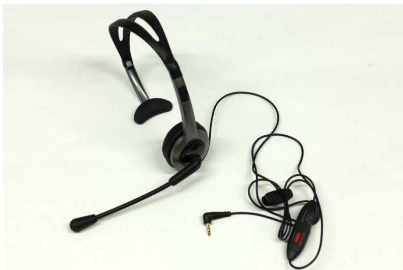
Fig. 13: Pictures of the used headset RP-TCA430.