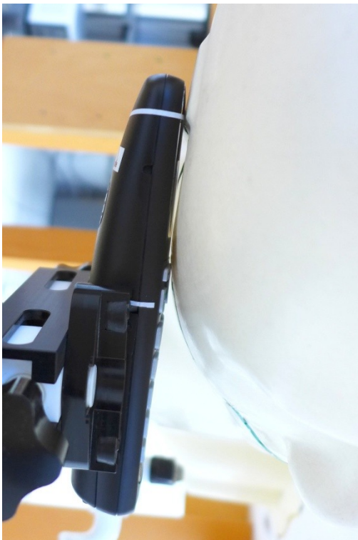
Pic. 5: Cheek position, right side.