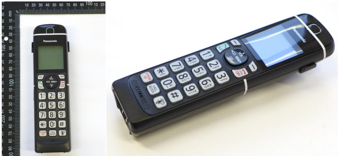
Pic. 1: Front and right side views of the device under test.