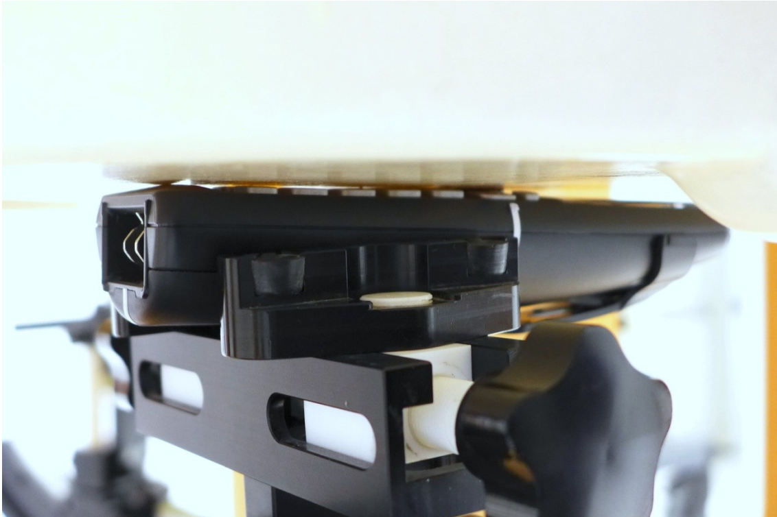
Pic. 7: Test position – front side, 0mm distance to phantom.