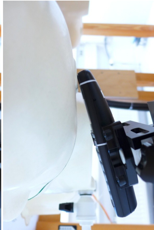
Pic. 4: Tilted position, left side.