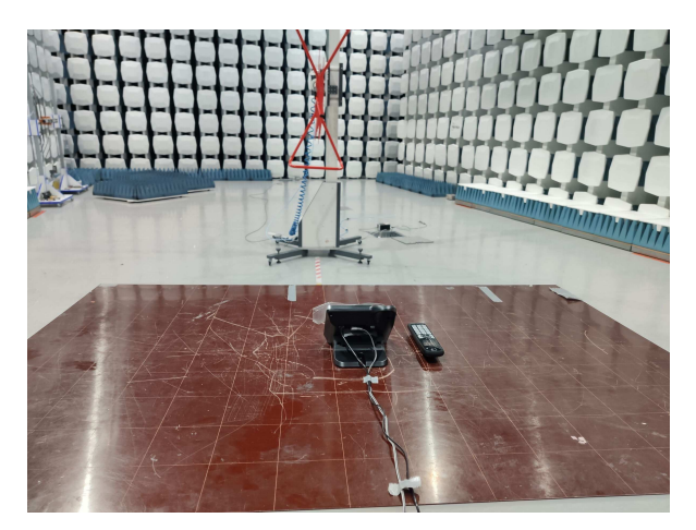
Radiated Emissions 30 – 1000 MHz