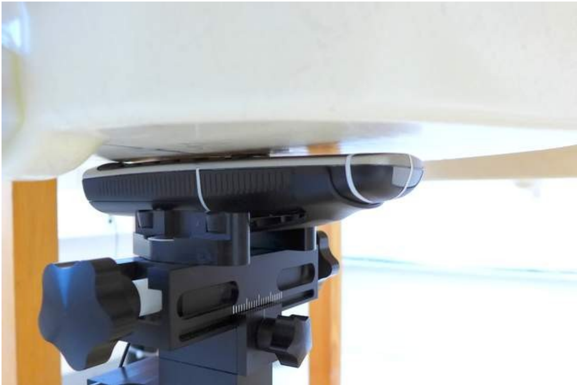
Pic. 7: Test position – front side, 0mm distance to phantom.