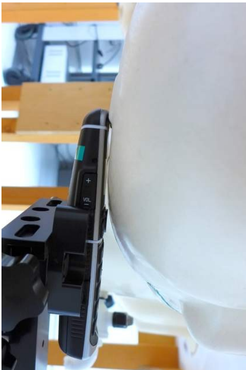
Pic. 5: Cheek position, right side.