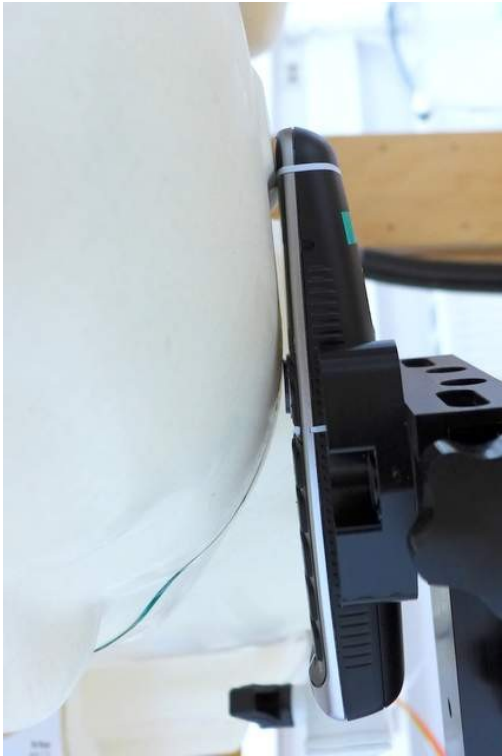
Pic. 3: Cheek position, left side.