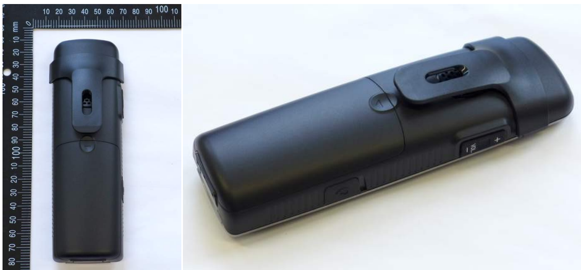
Pic. 2: Back and left side view of the device under test.