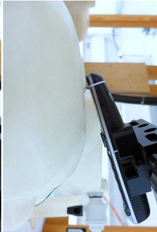
Pic. 4: Tilted position, left side.