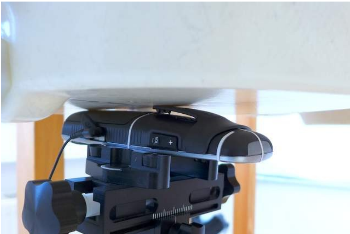
Pic. 8: Test position – back side, 0mm distance to phantom.