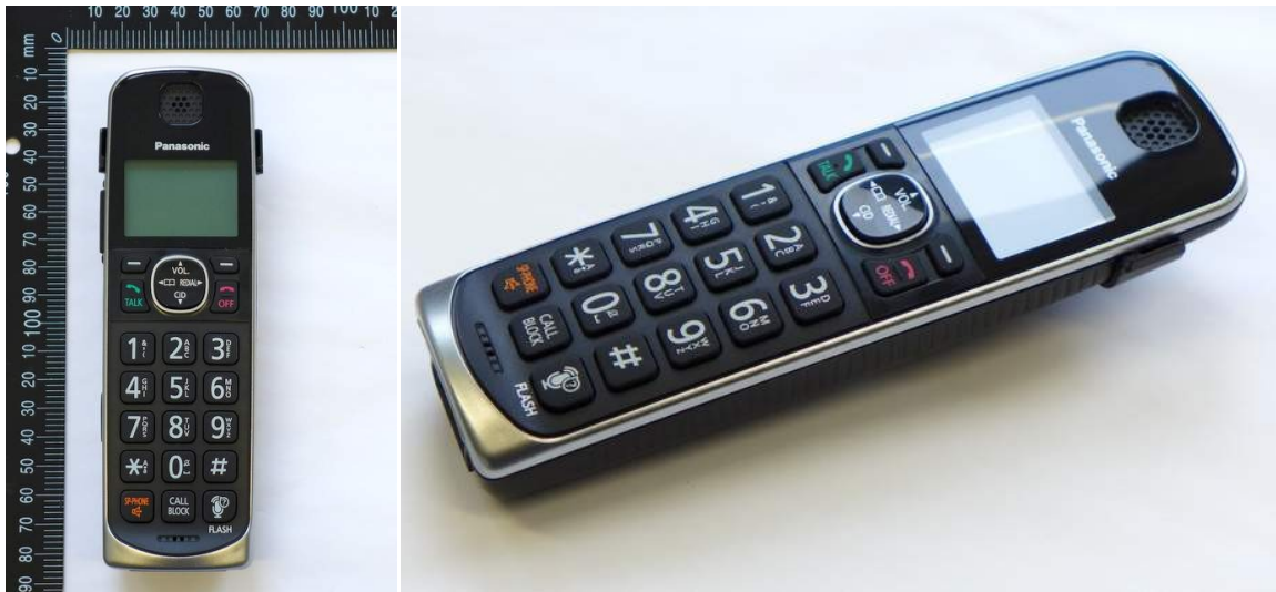
Pic. 1: Front and right side view of the device under test.