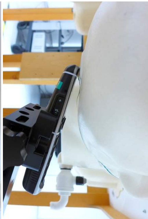
Pic. 6: Tilted position, right side.