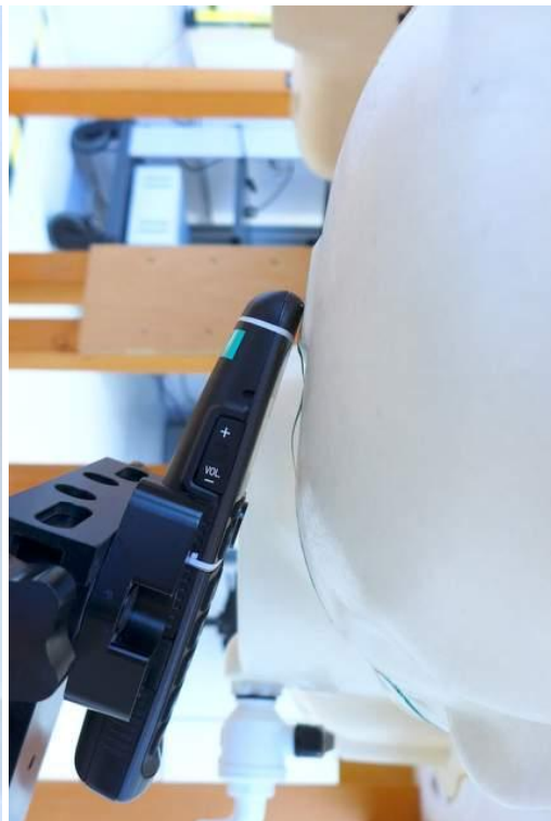
Pic. 6: Tilted position, right side.