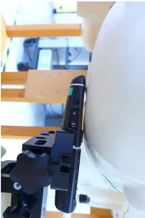
Pic. 5: Cheek position, right side.