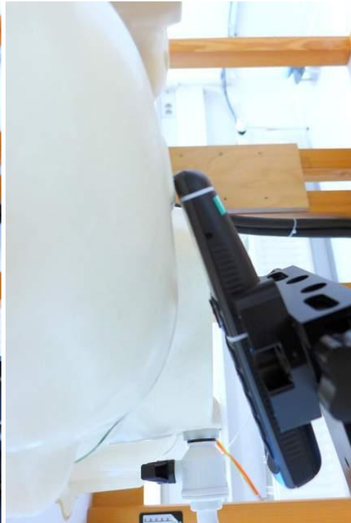
Pic. 4: Tilted position, left side.