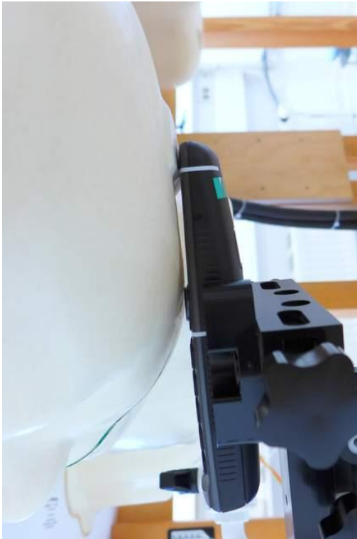
Pic. 3: Cheek position, left side.