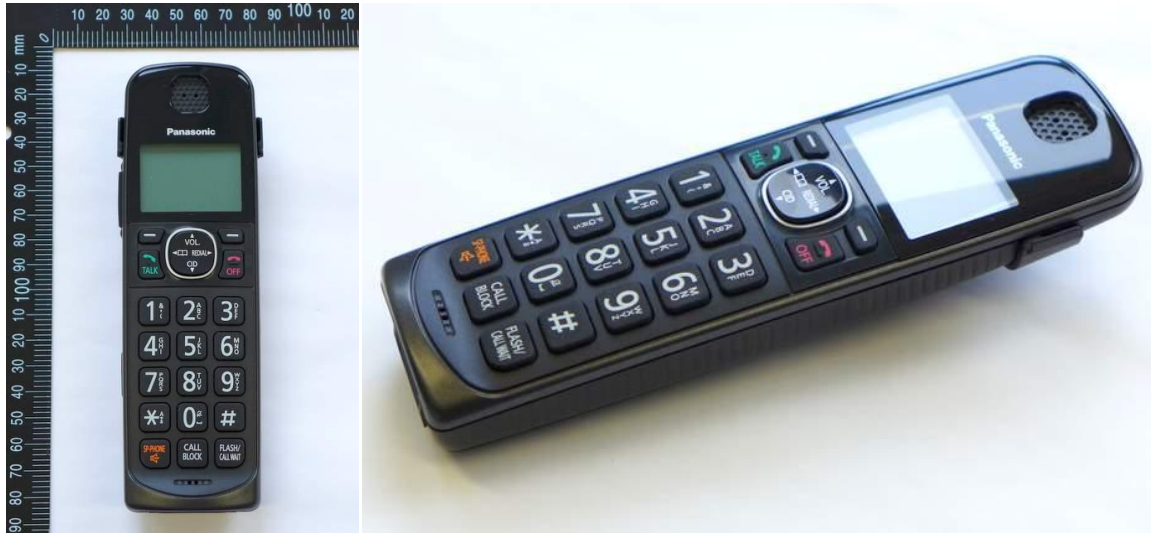
Pic. 1: Front and right side view of the device under test.