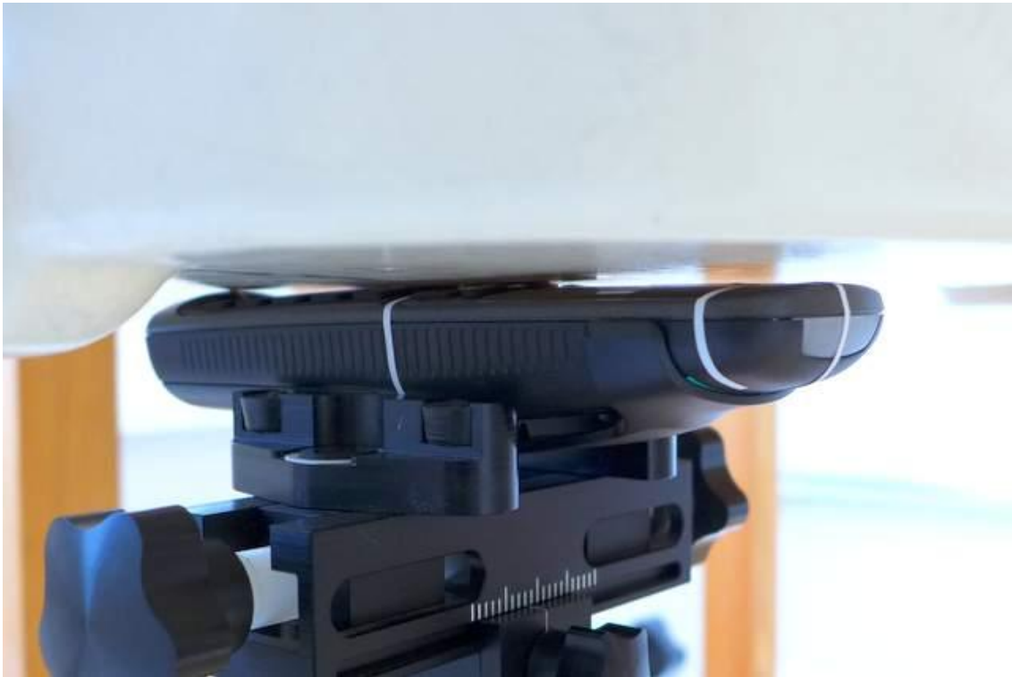
Pic. 7: Test position – front side, 0mm distance to phantom.