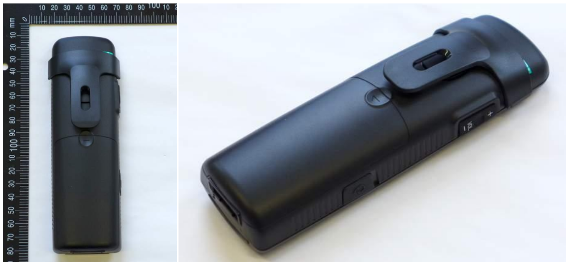
Pic. 2: Back and left side view of the device under test.