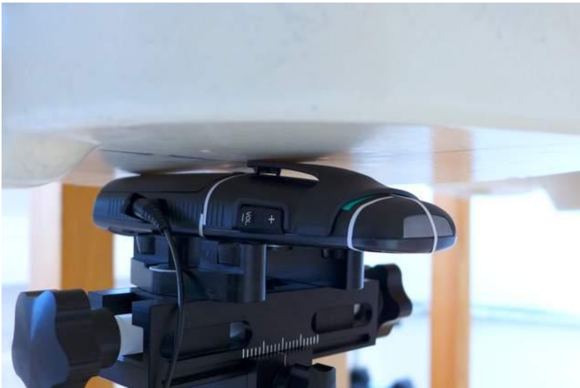
Pic. 8: Test position – back side, 0mm distance to phantom.