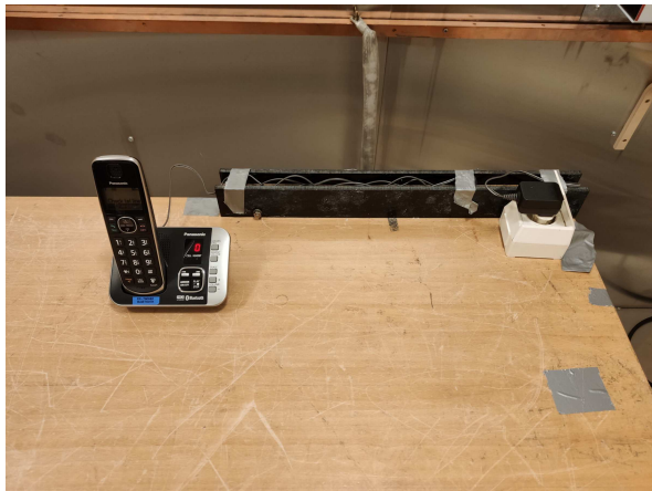
Power-Line Conducted Emissions