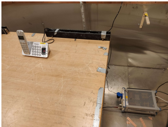
Power-Line Conducted Emissions