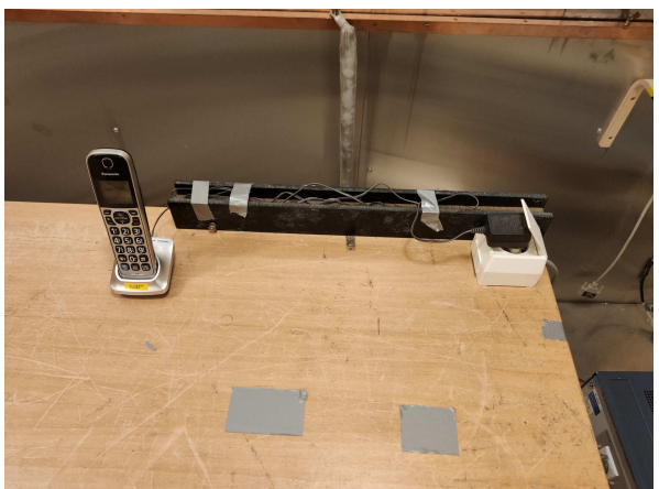
Power-Line Conducted Emissions