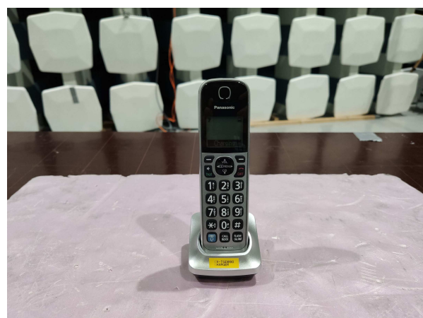
Radiated Emissions 30 – 1000 MHz, Charging