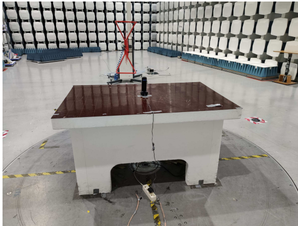
Radiated Emissions 30 – 1000 MHz