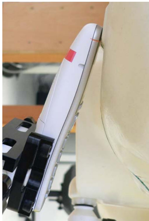
Fig. 15: Tilted position, right side.