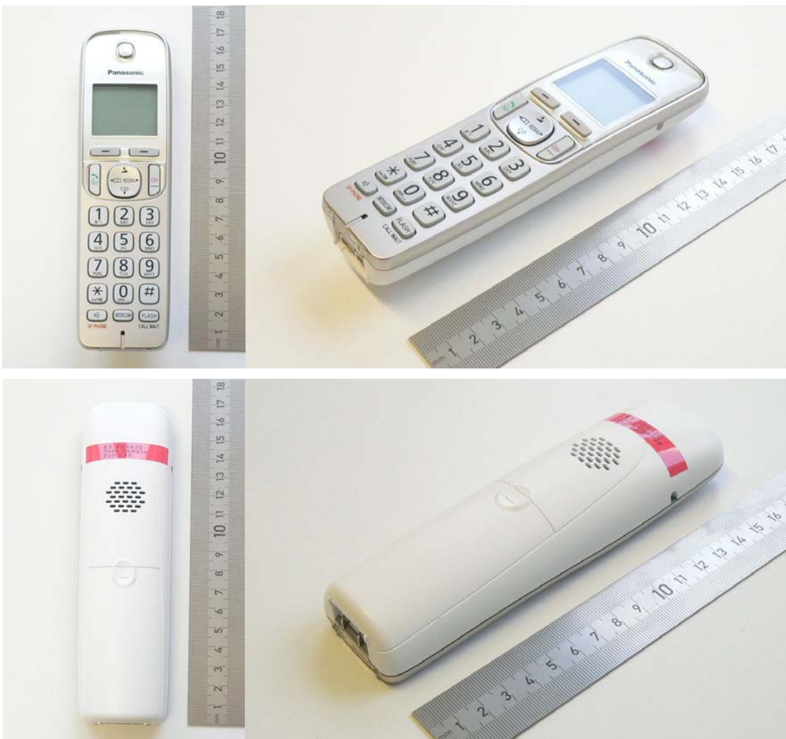
Fig. 11: Pictures of the device under test.