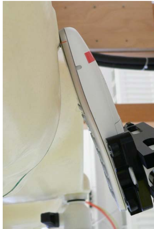
Fig. 13: Tilted position, left side.