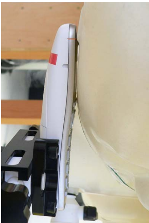
Fig. 14: Cheek position, right side.