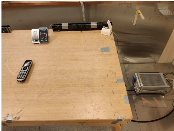
Power-Line Conducted Emissions