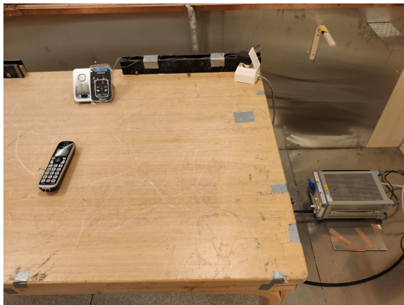
Power-Line Conducted Emissions