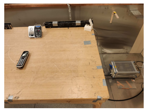
Power-Line Conducted Emissions