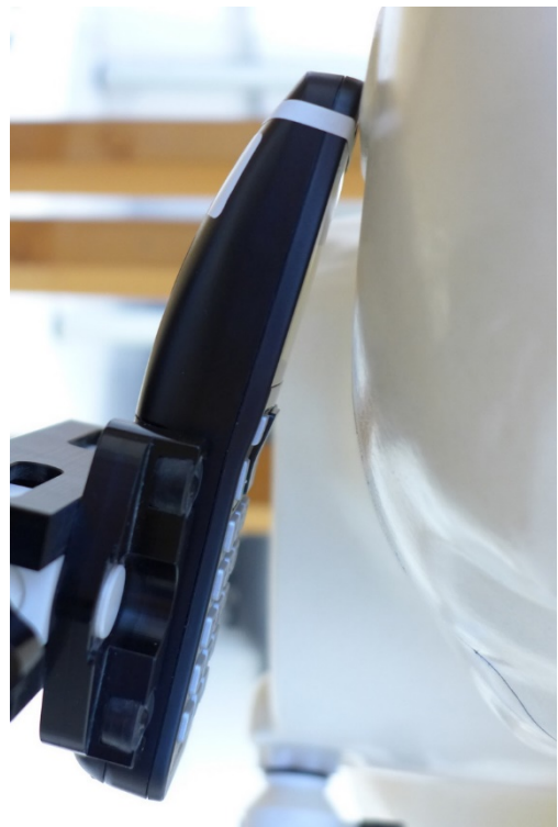
Pic. 6: Tilted position, right side.