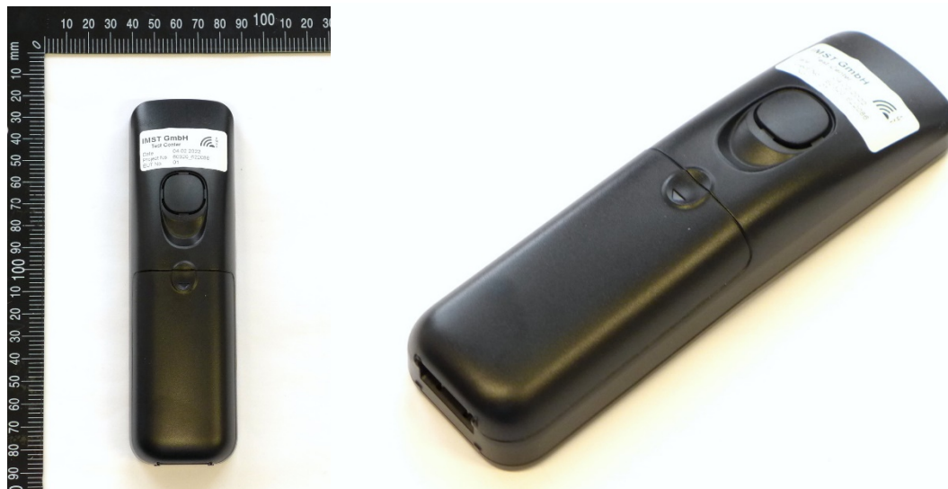
Pic. 2: Rear side views of the device under test.