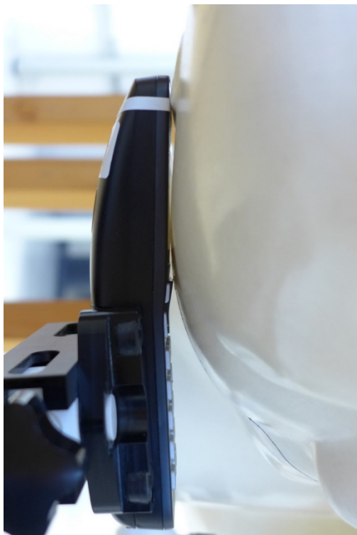
Pic. 5: Cheek position, right side.