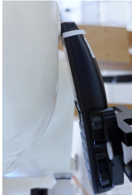
Pic. 4: Tilted position, left side.