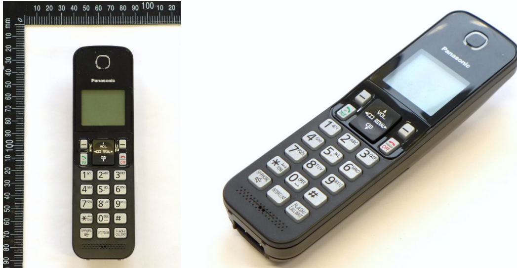
Pic. 1: Front side views of the device under test.