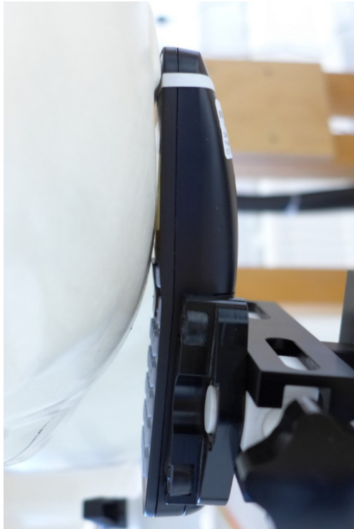
Pic. 3: Cheek position, left side.