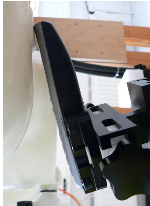
Fig.15: Tilted position, left side.