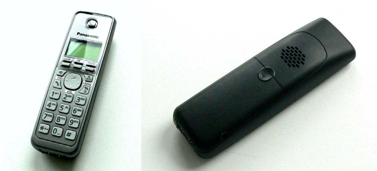
Fig. 13: Pictures of the device under test.