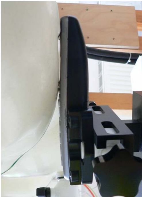
Fig. 14: Cheek position, left side.

Figure 14 - 19 show the test positions for the SAR measurements.