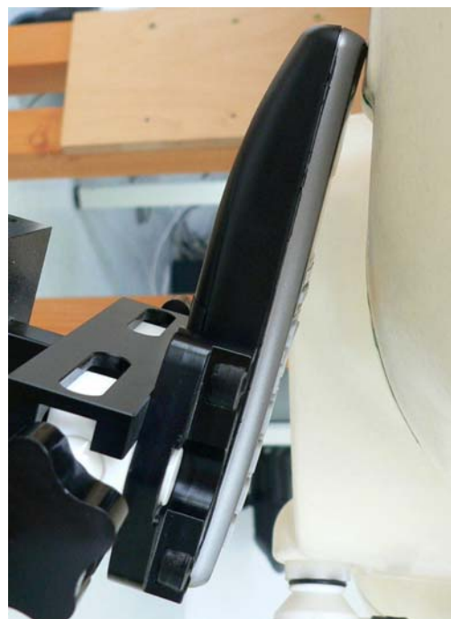
Fig. 17: Tilted position, right side.