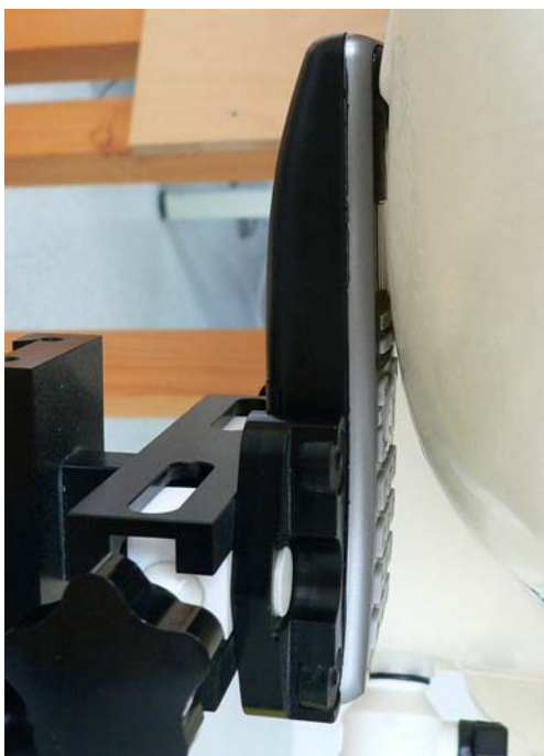
Fig. 16: Cheek position, right side.