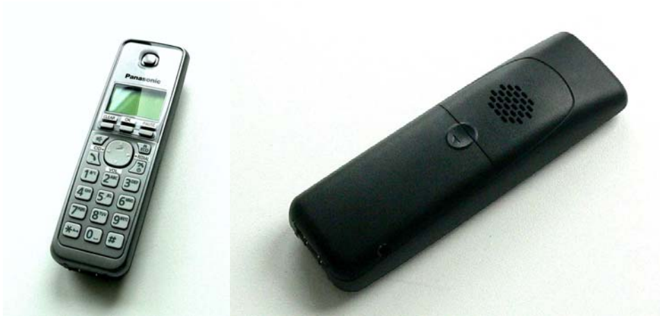
Fig. 1: Pictures of the device under test.