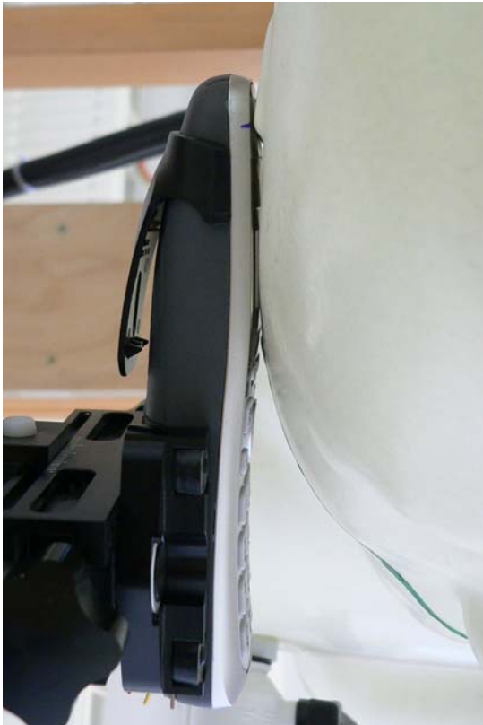
Fig. 17: Cheek position, right side.