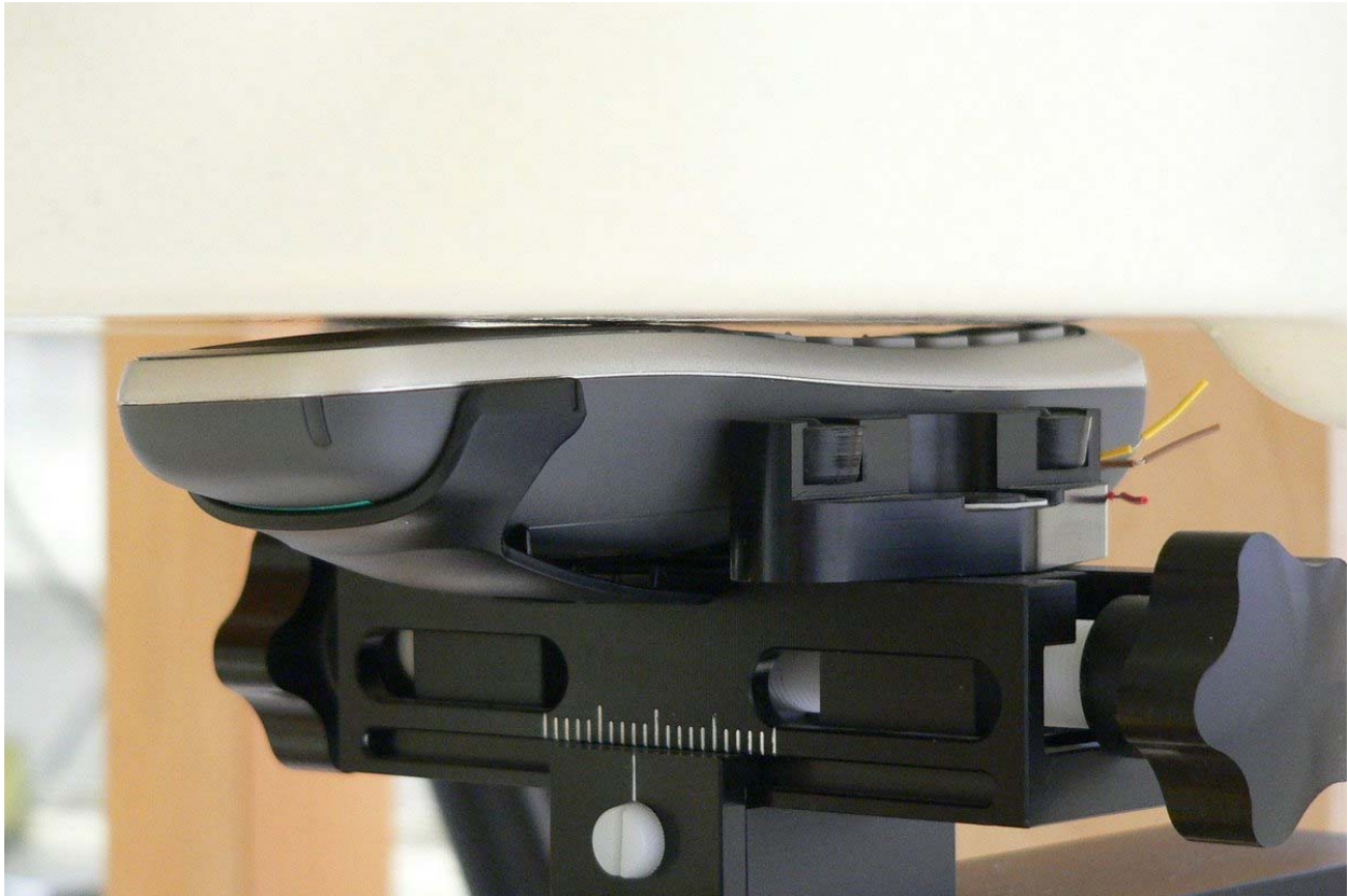
Fig. 19: Body worn configuration, with belt clip, display towards the phantom.