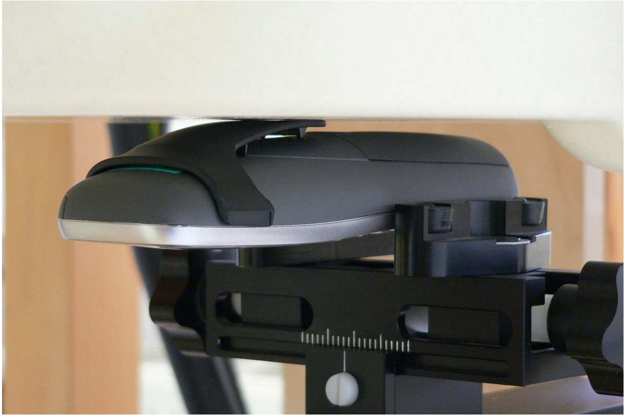
Fig. 20: Body worn configuration , with belt clip, display towards the ground.