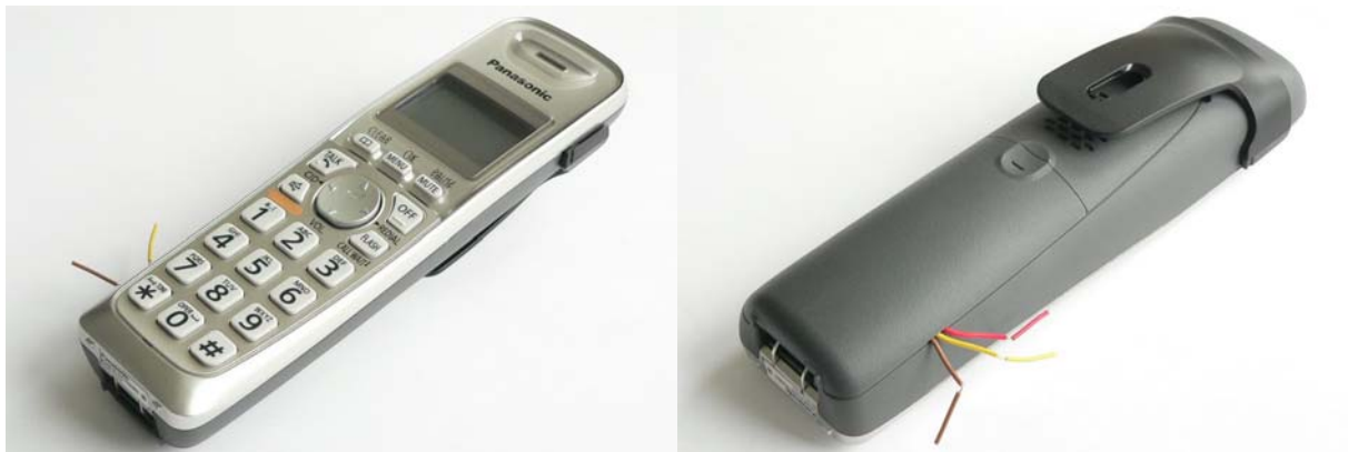
Fig. 14: Pictures of the device under test

Fig. 14 shows the device under test and the used accessories.