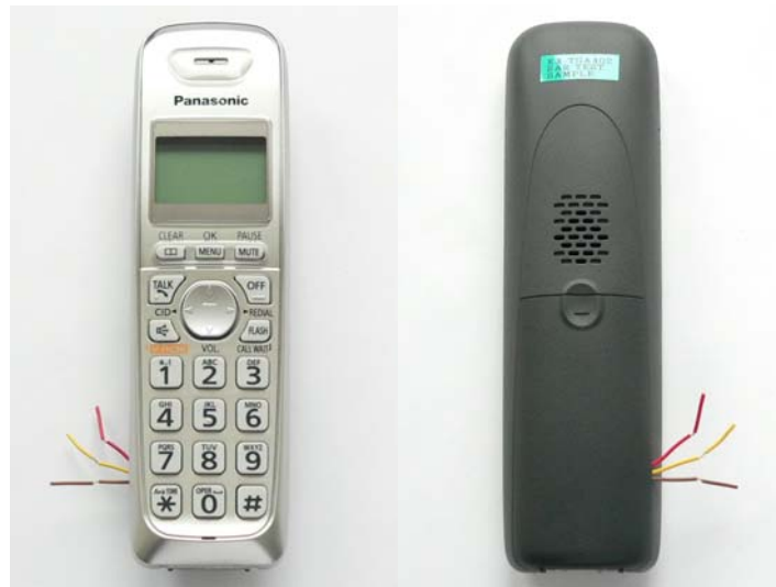
Fig. 1: Pictures of the device under test