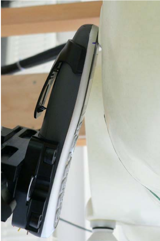
Fig. 18: Tilted position, right side.