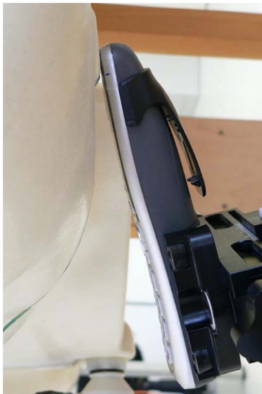
Fig. 16: Tilted position, left side.