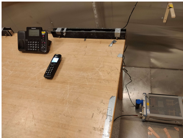
Power-Line Conducted Emissions