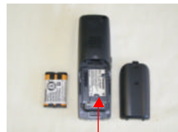
FCC ID Label

The marking will be shown on the battery compartment of the portable unit.